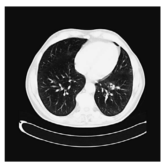
Fig. 1. Computed tomography scan performed after 6 cycles of adjuvant FOLFOX therapy showing normal finding.