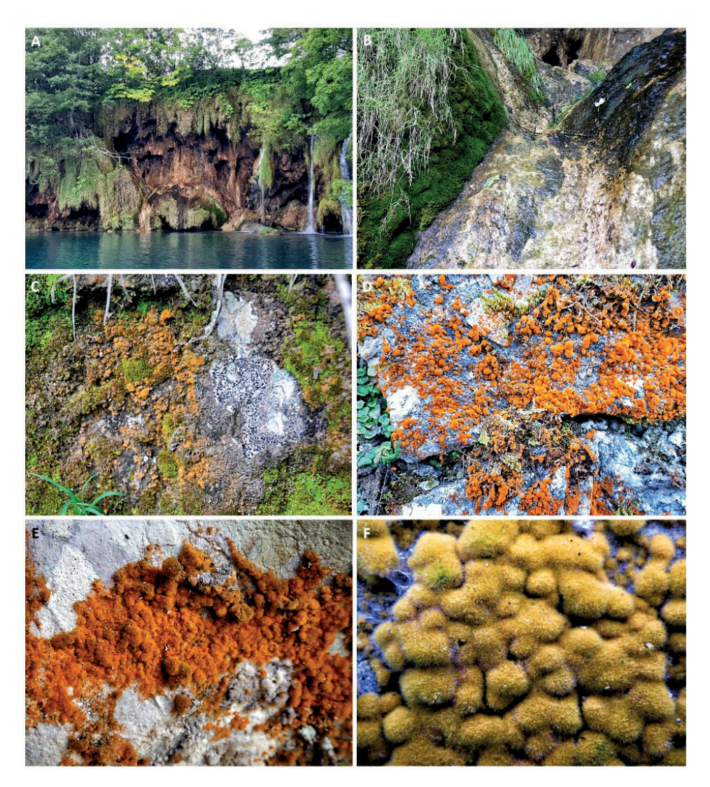
Fig. 3. ( A ) Tretepohlia aurea beneath the waterfall on the Kozjak Lake on the Plitvice Lakes with ( B ) detailed photo of the microlocation; ( C ) site on the left bank of the Galovac Lake; ( D ) ( E ) site from Vukova Gorica; ( F ) site from Čedanj.

surfaces between the bryophytes but were also found abundantly attached directly to the bryophytes, mostly Ctenidium molluscum , with a few thalli on Schistidium apocarpum . Sporadic thalli of the lichen Collema auriforme were also recorded in these populations. On the other hand, there was no bryophyte vegetation at all on concrete walls.