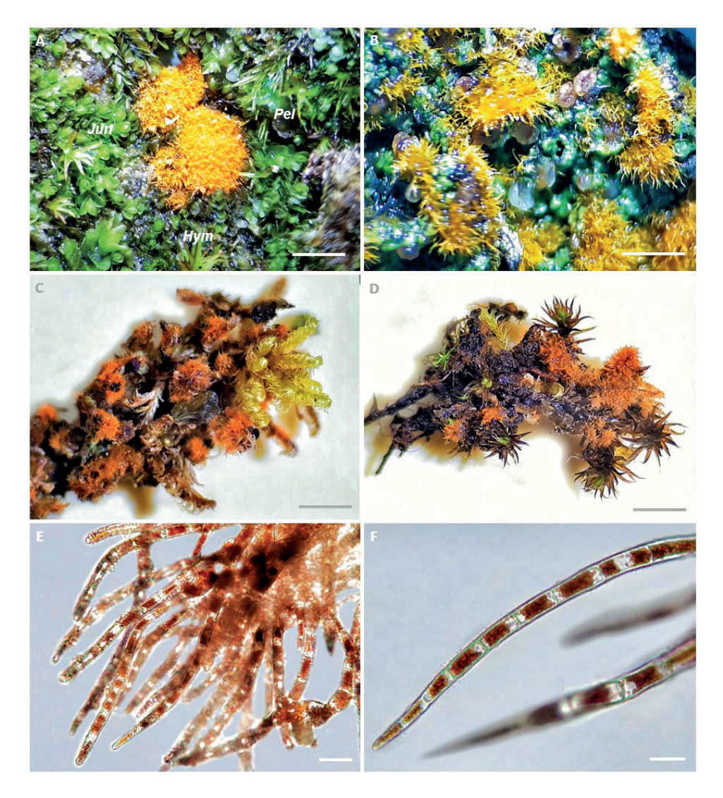
Fig. 2. ( A ) Patches of Trentepohlia aurea with bryophytes on the site beneath the waterfall on the Kozjak Lake on the Plitvice Lakes, scale = 2 cm ( Hym - Hymenostylium recurvirostrum, Jun - Jungermannia atrovirens, Pel - Pellia endiviifolia ); ( B ) patches of T. aurea from the Kozjak Lake site incorporated with lichen Collema auriforme within bryophytes, scale = 5 cm; ( C ) T. aurea and C. auriforme covering the bryophyte Ctenidium molluscum, scale = 1 cm; ( D ) T. aurea and C. auriforme covering bryophyte Hymenostylium recurvirostrum, scale = 1 cm; ( E ) detailed structure of T. aurea thalus showing uniseriate filaments, scale = 100 µm; ( F ) detailed structure of T. aurea filament showing cylindrical cells, scale = 50 µm.

of alga ranging between 0.5 and 15 cm in diameter were densely arranged on a surface of approximately several dozen square meters, mostly merged in larger clusters (Fig. 3D, E). The patches inhabiting a stone wall and limestone rocks were found in the close proximity of bryophytes, mainly Ctenidium molluscum and Encalypta streptocarpa , with a few vascular plants scattered in fissures (Tab. 1). Algal patches covered the rock