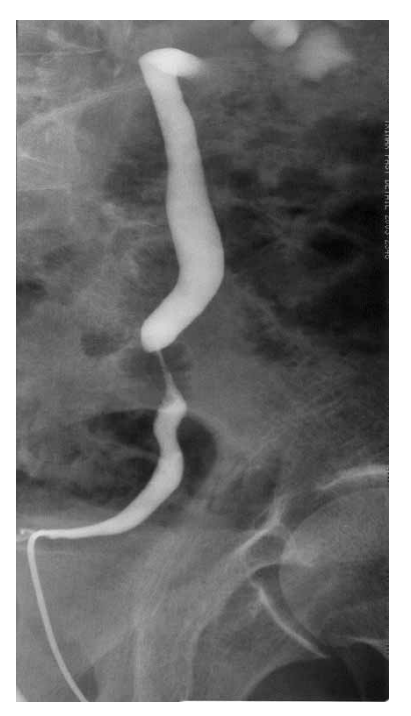
Fig. 1. Obstruction of the left ureter

Explorative laparotomy showed a foreign body (toothpick) perforating the sigmoid colon through the mesenterial wall, and being stocked with one-third into the left internal iliac artery, causing arterial-colic fistula (Figure 2). The remaining part of the toothpick was in the lumen of the rectosigmoid colon surrounded by granulation tissue and chronic inflammatory process, pressing on the distal third of the left ureter and causing hydroureter and hydronephrosis. The toothpick and the granulation tissue were removed, and after on-table lavage, the patient underwent a segmental resection of the colon with