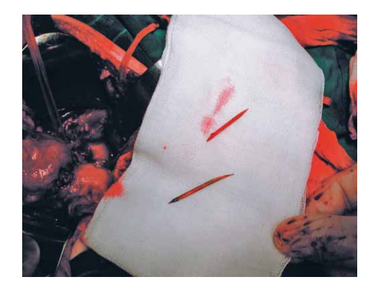
Fig. 2. The toothpick with its clean paracolic and dirty colic part.

After undergoing surgery, the patient was put on antibiotics and was discharged 14 days after admission with a normal RBC count and with normal colonic and renal function.