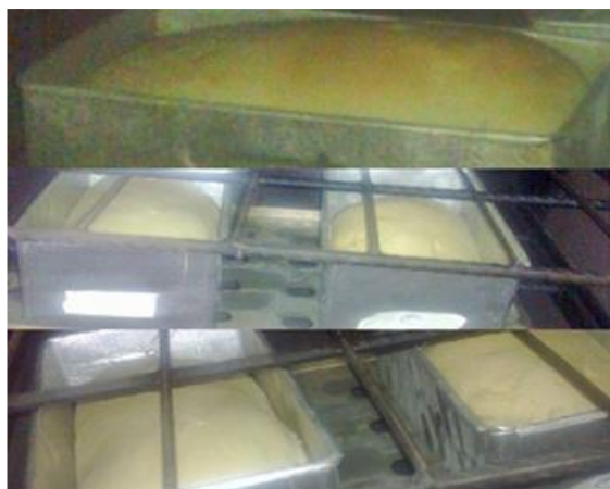
Fig. 2. Bread samples during baking