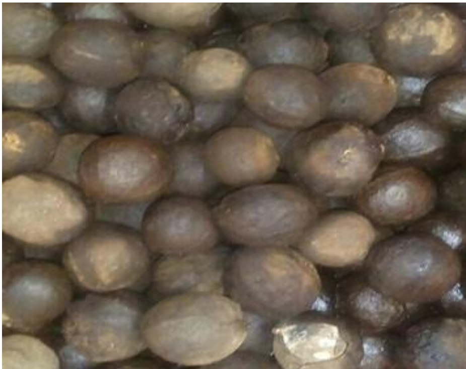
Fig. 1. Unshelled African walnut seed

al., 2007; Alasalvar et al., 2009). The protein quality of African walnuts seed encourages the possibility of its usage as an ingredient in confectionery products (Awofadeju, 2020). The increase in its utilization is largely due to its excellent nutritional value (Ozdemir and Akinci, 2004). Previous study revealed the protein quality of African walnut protein isolate, wheat and yellow maize flours which could be included in Nigerian diet and food industry (Awofadeju, 2020); the protein quality of bread enriched with African walnut and wheat flours (Awofadeju et al., 2018), and nutritional and organoleptic evaluation of cookies produced from African walnut and wheat flours (Awofadeju et al., 2015). The non-use of this underutilized crop for human food constitutes a real economic loss since it is rich in essential nutrients which can be used as value-added ingredients. Despite its richness in lysine and tryptophan amino acids, it is also deficient in methionine which could be found in wheat and yellow maize. Nevertheless, the process of blending the three crops could bring about improved nutrient through complementation (Potter and Hotchkiss, 2006). These could enhance the wheat products with better nutrients and healthy and good functional characteristics. The aim of this study was to optimize a cereal blend (wheat, yellow maize flours and African walnut protein isolate) for cookie making and evaluate its proximate composition and general acceptability.