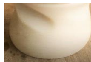
Plate 2: 100% soaked BM