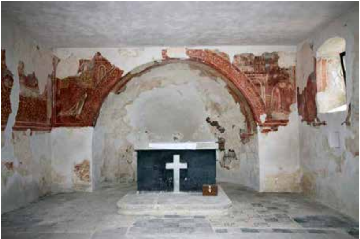
Sl. 7. Hum, Sv. Jerolim, oslik svetišta, kraj 12. st. Fig. 7 Hum, St. Jerome, painting of the sanctuary, end of 12th century

U Sv. Agati kod Kanfanara perojski se vizionarski linearizam i geometrizacija kodificiraju u izrazito tvrdom rustičnom stilu, jasno određenih jednobojnih površina (sl. 4). Ako se može reći, Peroj je viskointelektualni stil ladanja (što romanika u velikoj mjeri i jest), a Kanfanar geometrizirana naiva, stećak na površini zida. Fizionomije svetaca u Sv. Agati, npr. sv. Bartolomej (Fučić 1963, sl. 3 u knjizi), jako podsjećaju na netom spomenuti „pret-povijesni“ lik sv. Mateja iz Sv. Lucije u Jurandvoru. Izduženo lice, koje se uklapa u kružnicu aureole, velike „urezane“ oči, dugi uzani nos, male, lagano napućene usne. U punom smislu u stvaralačkom krugu izvanvremenskog rusa . 11