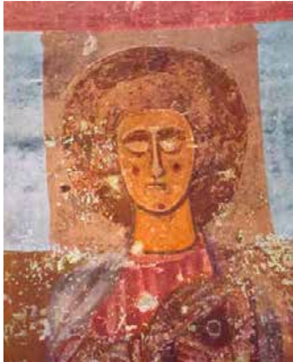
Sl. 4. Kanfanar, Sv. Agata, svetački lik, poč. 12. st.

Poljodjelska stvarnost freske u Srimi nije nametnuta niti izmišljena. Gospina crkvice stoji na uzvisini koja nadgleda polja i vrtače okolice Šibenika i svojom suhom paletom i mršavom formom rekreira