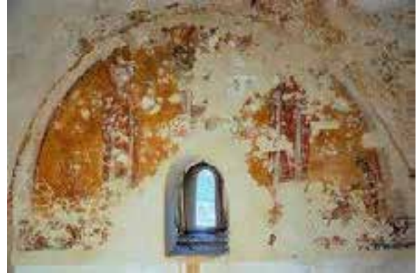
Sl. 2. Srma, Sv. Marija, oslik apside, 12. st. Fig. 2 Srma, St. Mary, painting of the apse, 12th century