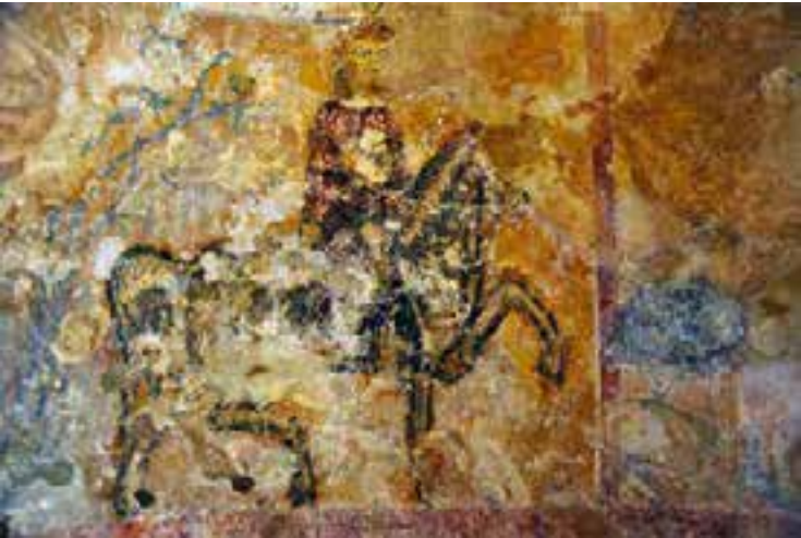
Sl. 8. Svetvinčenat, Konjanik (Mjesec Svibanj), kraj 13. st.

Fig. 8 Svetvinčenat, The Horseman (The Month of May) , end of 13th century