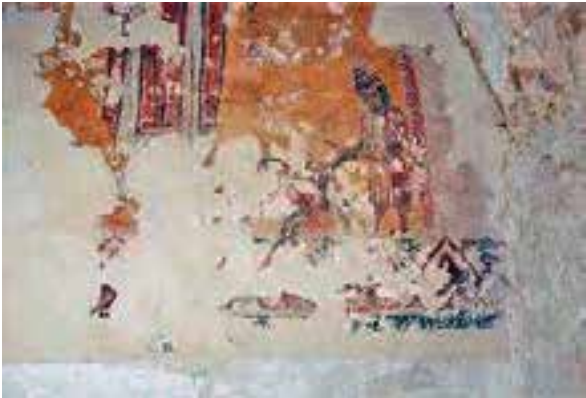
Sl. 3. Srima, Sv. Marija, oslik apside, Orač

Fig. 3 Srima, St. Mary, painting of the apse, The Ploughman