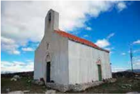
Sl. 1. Srma, Sv. Marija Fig. 1 Srma, St. Mary