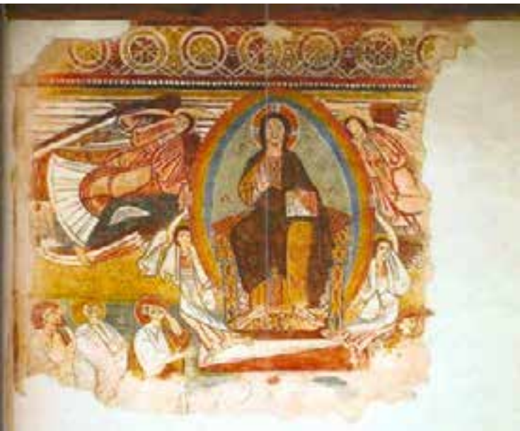
Sl. 6. Peroj, Sv. Foška, Krist u slavi, oko 1100.

Fig. 6 Peroj, St. Foška, Christ in Majesty, around 1100