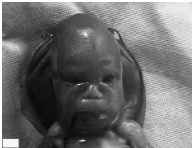
Figure 10. Appearance of aborted fetus from the Figure 9 with hydrops, cystic hygroma and morphological changes of the face

Slika 10. Izgled ploda sa slike 9 koji ima hidrops, cistični higrom i morfološke promjene na licu