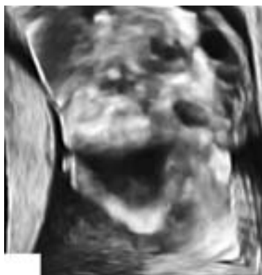
Figure 2. Cystic hygroma in fetus with Turner syndrome. 3D view with clearly depicted septum

Slika 2. Cistični higrom vrata u ploda s Turnerovim sindromom. 3D prikaz jasno vidljivog septuma