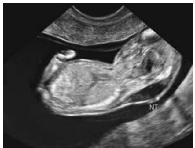
Figure 1. Increased nuchal translucency at 12 weeks of gestation Slika 1. Povećana nuhalna prozračnost u ploda od 12 tjedana

Increased NT in Turner syndrome is observed in 85% of fetuses, while moderate intrauterine growth restriction and tachycardia are observed in 50% of cases. 7 Increased NT appears in 60% of triploidy cases. Early and asymmetric growth restriction, bradycardia, holoprosencephaly, exomphalos, cyst of the posterior fossa, cerebral anomalies, abdominal wall defects are found in 40% of fetuses, while in 30% of them molar changes in the placenta are present. 8 Cardiac anomalies seem to be the most important major structural abnormalities linked to increased NT, with the exponential raising of