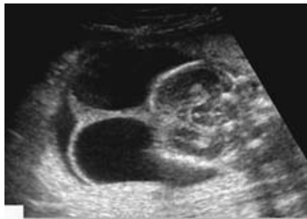
Figure 3. Septated cystic hygroma in fetus with Turner syndrome in the 2 nd trimester of pregnancy

The fetuses with 45,XO Turner syndrome develop in the second trimester severe lymphatic abnormalities visible by ultrasound. The most typical almost characteristic sign is septated cystic hygroma ( Figures 3 and 4 ). Of the fetuses with cystic hygroma 75% have chromosomal