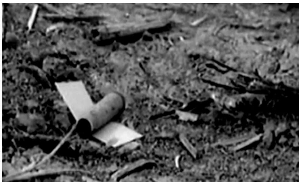
Figure 9. Spent AK47 ammunition on the surface of the Ovčara mass grave site near Vukovar [36] (reproduced with permission).