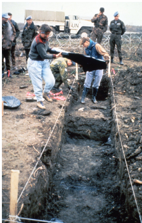
Figure 8. The preservation of bodies from the test trench during the preliminary investigation of the Ovčara mass grave [36] (reproduced with permission).

The preliminary investigation produced detailed documentation on the findings from the exhumation site, exhumation methods, and examinations of the bodies, which was supplemented by hand-drawn sketches as well as photo and video recordings [37] (Figure 10). Following the preliminary investigation, the team's priority was to secure the crime scene; the site was cordoned off with two rows of concertina wire and UNPROFOR Russian Battalion (RUSBAT) guard stations were placed