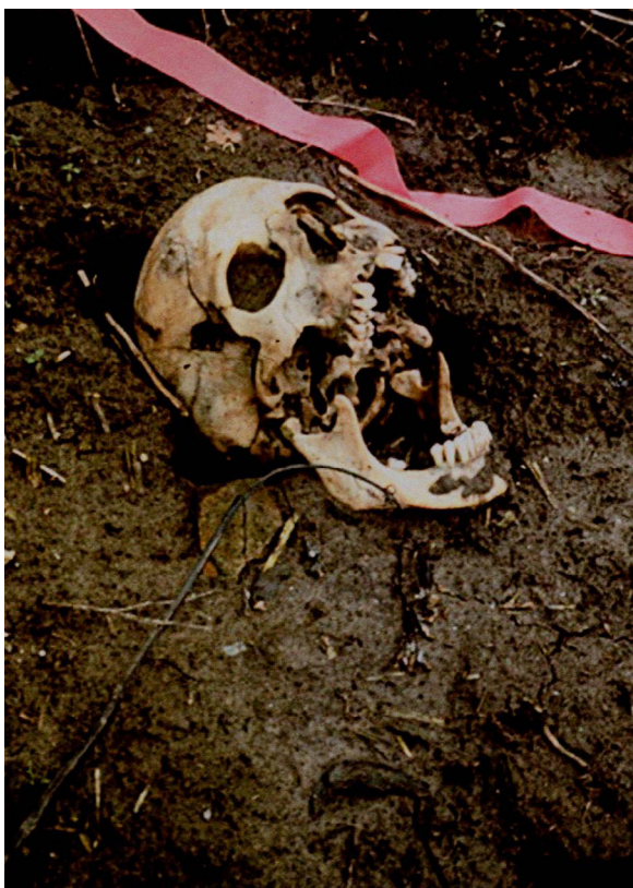
Figure 3. A photograph of the skull on the surface of the Ovčara mass grave [24] (reproduced with permission).

Shortly after the existence of the gravesite at Ovčara was confirmed, the Special Envoy of the UN Secretary-General recommended to the Special Rapporteur of the Commission on Human Rights to carry out the investigation as soon as possible to protect key evidence [32]. Although the local authorities did not consent to the investigation, in December 1992,