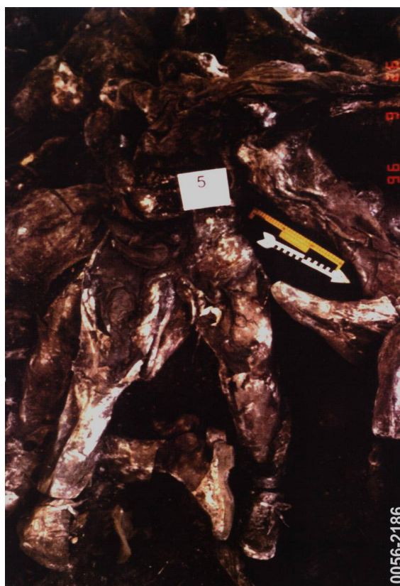
Figure 12. Entwined bodies dressed in civilian clothes and work wear and shoes [24] (reproduced with permission).

The first lot of exhumed remains was transported to the Institute of Forensic Medicine in Zagreb for further processing. The last of the 200 victims was exhumed on 4 October 1996 [36].