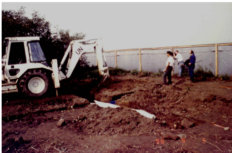
Figure 5. The excavation of the test trench across the surface of the mass grave at Ovčara [24] (reproduced with permission).