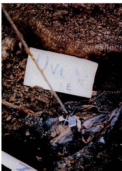
Figure 6. A necklace with Catholic insignia found on a body outside the Ovčara grave [24] (reproduced with permission).

Necklaces with Catholic crosses and a medallion with the inscription “Bog i Hrvati” (God and the Croatians), such as were often worn by members of the Croatian Armed Forces, were discovered on the partially skeletonized bodies of young men that were found outside the grave [34] (Figure 6).