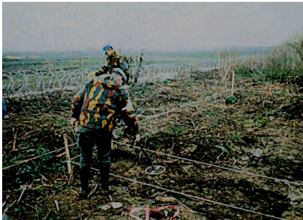
Figure 4. A topsoil security check with a metal detector at, at that time, alleged mass grave site at Ovčara [24] (reproduced with permission).

under the auspices of the UN Commission of Experts, a four-member forensic team deployed by the PHR conducted a preliminary investigation [34]. The investigation began with a security check; simultaneously, aerial footage was taken of the gravesite in its natural environment and the overgrown surface vegetation was then cleared [34] (Figure 4).