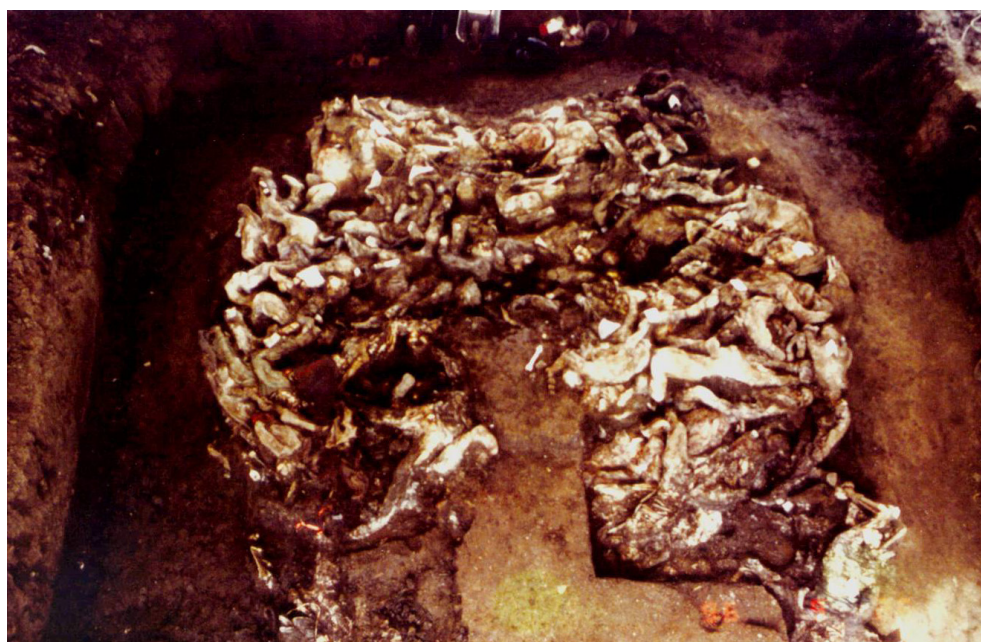
Figure 13. Entwined bodies in the Ovčara mass grave [24] (reproduced with permission).