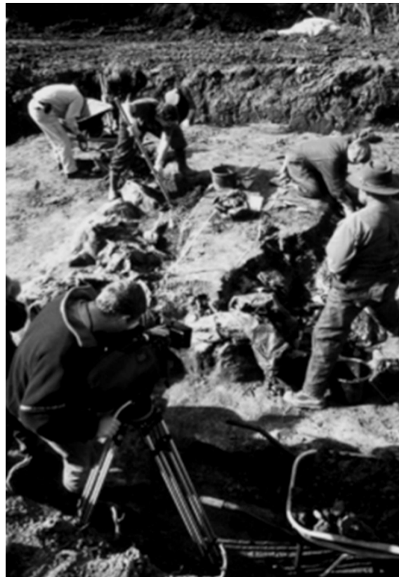
Figure 11. The PHR team manually removes earth from the Ovčara grave [36] (reproduced with permission).

The exhumation began by removing the topsoil mechanically. The black film that was utilized by the first team of forensic experts to protect the skeletal remains from the test trench upon completion of the preliminary investigation in 1992 was uncovered on the third day [36]. The exhumation carried on by manual digging and other archaeological methods to preserve the bodies and evidence [39] (Figure 11).