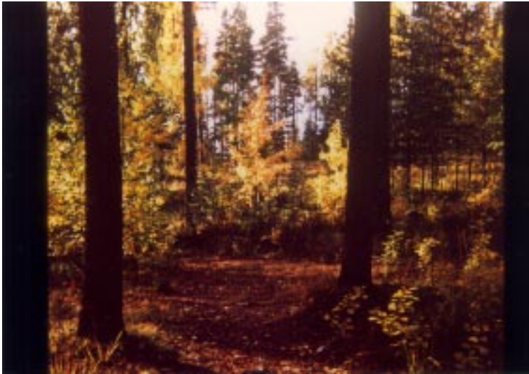
FG. 1. Photo of typical Finnish forest