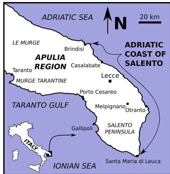
Fig. 1. Map of the Salento peninsula (Apulia Region, south-eastern Italy), showing the extent of the Adriatic coast of Salento, from which the cetacean and chelonibiid specimens described herein have been collected. Modified after PERI et al. (2019)

This paper describes the unusual association between a cetacean scapula and several chelonibiid barnacle shells that adhere to its outer cortical surface. This bone and its crustacean encrusters are currently kept in the zoological collection of the Museo di Storia Naturale dell'Università di Pisa (hereinafter: MSNUP) under the accession number MSNUP C 3240. They were recovered by the late Angelo Varola (†2019) from a shallow seafloor off the eastern (i.e., Adriatic) coast of Salento, between Brindisi and Santa Maria di Leuca (Apulia Region, southeastern Italy) (Fig. 1). Although the precise locality of MSNUP C 3240 is unknown, its provenance – the Adriatic Sea facing Salento – is ascertained.