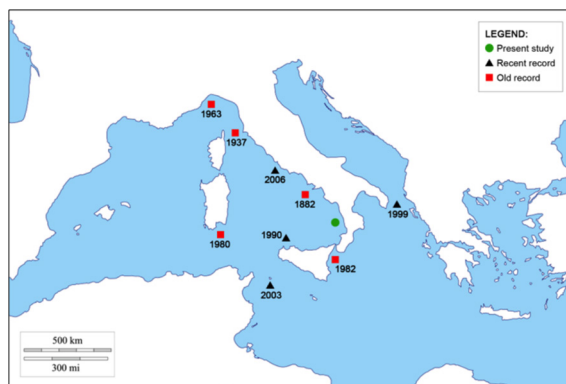
Fig. 1. Italian records of Tetragonurus cuvieri . For further details see the "Introduction" section of the main text

The specimen of T. cuvieri showed a typical uniform black color pattern (Fig. 2). It was also recognized by its distinctive jaws, scalation and body form. In particular, the lower jaw was very stout and had a single row of fan-like teeth. It was almost totally concealed by the upper jaw when the mouth was closed. The upper jaw had small pointed teeth in a single row (FROESE & PAULY, 2019). The long and slender body was rounded in cross section and was characterized by the presence of small, ridged scales arranged in spirals around the body (TORTONESE, 1970; HAEDRICH, 1986). The caudal peduncle was rectangular in cross-section and had two lateral keels on both sides. The basic morphometric measures (as absolute values and indexes of total length) and meristic counts are given in