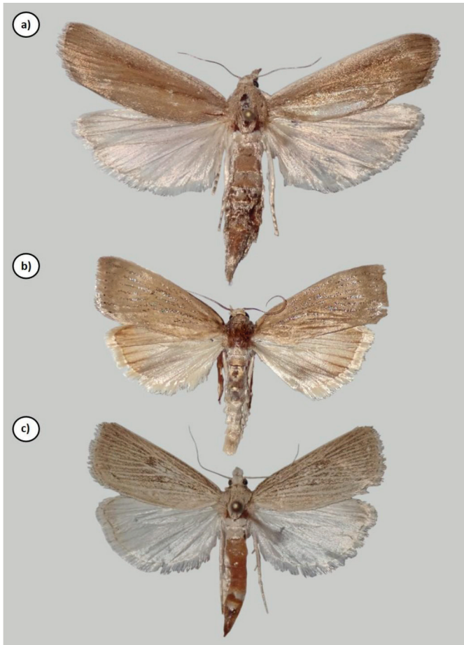
Fig. 2. a) Thopentis galleriellus from Rogotin, Neretva; b) Chilo luteellus from Rogotin, Neretva; c) Chilo pulverosellus from reed channels around the river Norin.

Notes: Chilo pulverosellus is similar to the other members of the genus Chilo , but the labial palpi are shorter and forewing venation is often dark-scaled (SLAMKA, 2008). According to ASSELBERGS (2006) Ch. pulverosellus has labial palps of 2.5 x eye-diameter; the vertex is conical without a pinnacle and the forewings have a blackish discal and median spot. In Ch. luteellus the size of labial palps is 4 x eye-diameter in the male and 5 x in the female; the vertex is conical with a pinnacle and the forewings are without blackish spots (ASSELBERGS, 2006). In fresh Chilo sp. specimens, wing colorations are also very different in these two species. According to SLAMKA (2008) the species inhabits open habitats, including agricultural landscapes. Larvae have been found on Zea mays (SLAMKA, 2008). From the material collected in the Neretva River delta during the moth survey three specimens belonged to this species. This is a new species for Croatia, and a rather significant one as it both greatly expands the known range of the species and also bridges the gap between Italy and Eastern Europe. It is distributed in scattered localities across Spain, France, Italy, Bulgaria, Crimea, Asia Minor, Syria, Palestine, Transcaucasia and Trans-Caspian (ASSELBERGS, 2006; SLAMKA, 2008).