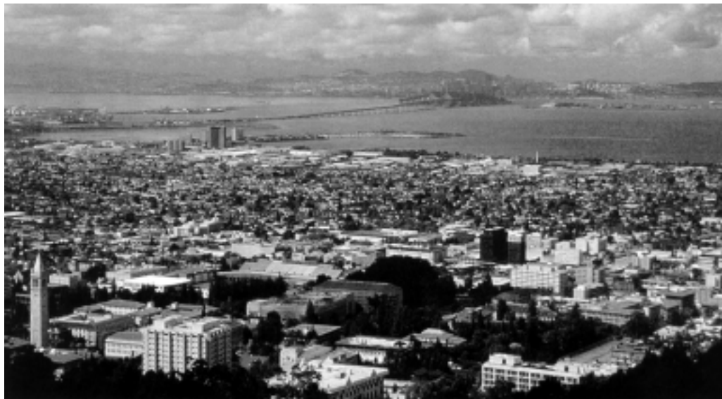
FIG. 5. A VIEW OF THE U.C. BERKELEY CAMPUS