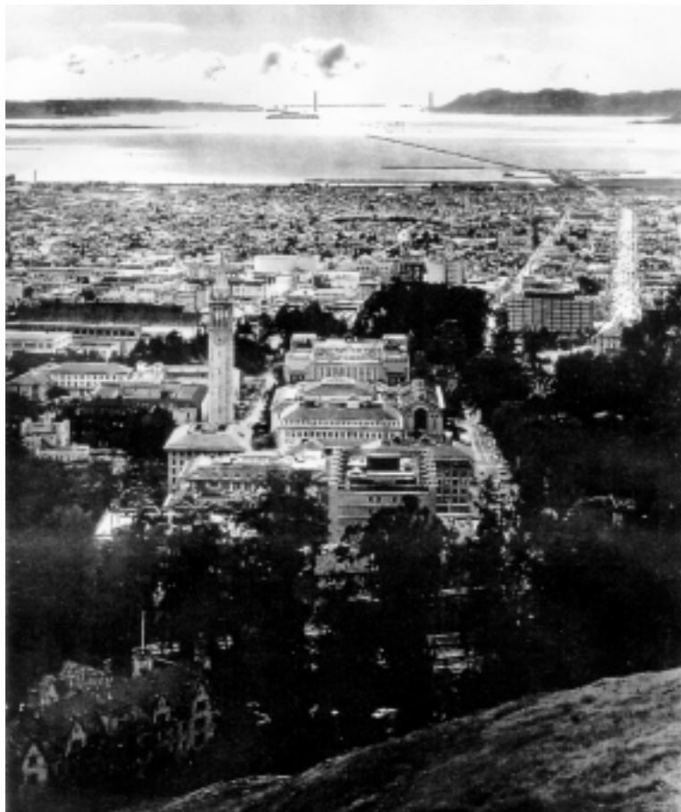
FG. 1. BERKELEY AS CAMPUS AND CITY SHARES AN EAST-WEST AXIS MARKED BY THE CAMPANILE, DOWNTOWN, UNIVERSITY AVENUE AND BERKELEY PIER. TOGETHER WITH NEIGHBOURHOODS TO THE NORTH AND SOUTH THESE CREATE A STRONG SOURCE OF COLLECTIVE IDENTITY.