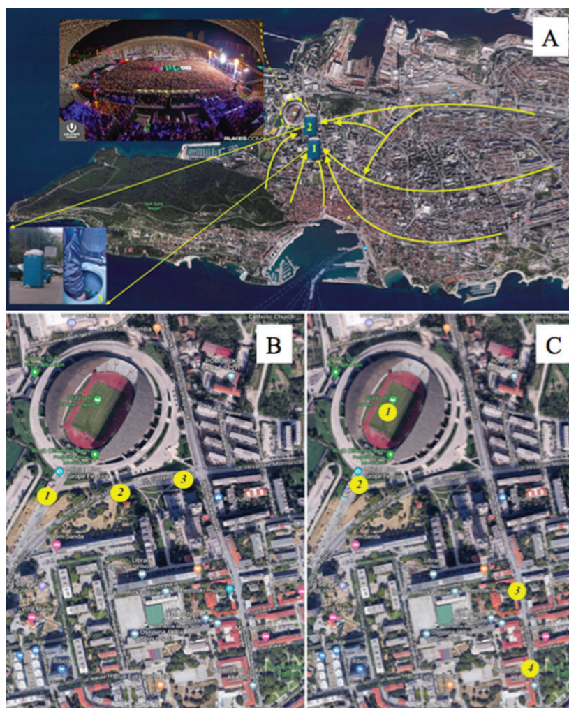
Figure 1 Location of the sampled chemical toilets during the Split Ultra music festival in 2016 (A), 2017 (B), and 2018 (C)

In 2017, sampling from four toilets with added chemicals placed at three locations by the stadium (Figure 1B) was scheduled to take place once a day at 2 am (Table 1), but on the second and the third day one of the two toilets at location 3 was out of commission, which is why we collected only ten urine samples.