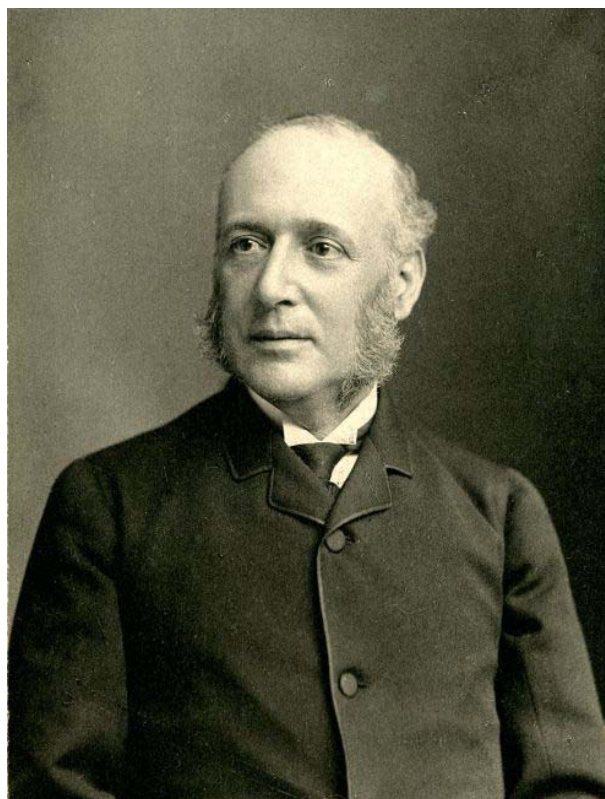
Figure 5. J.M. Da Costa circa 1880

Hypocapnia causes significant changes in the physico-chemical properties of the body, its metabolism and in many physiological functions. The current concept in Pathophysiology of hypocapnia (Kovač et al. 2014a) as well as related clinical cases (Kovač et al. 2014b) are reviewed in details elsewhere by Z. Kovač et al. As the partial pressure of \text{CO}_2 in blood decreases, the rhythmic excitation of the respiratory centre gradually weakens; the breathing becomes arrhythmic or completely stops. Pronounced hypocapnia causes a "hyperventilation syndrome" (Guyton & Hall 2006, Churilov 2015, Kovač et al. 2014a, 2014b). At the same time, cerebral circulation suffers with resulting dizziness, darkening and flickering in the eyes; psychomotor activity and fine motor coordination (like handwriting) come to disorder and even panic attacks may occur. Often there is a decrease in mental performance, disruption of orientation, hyper-tonus of skeletal muscles, convulsions and finally loss of consciousness (fainting) may occur (Kovač et al. 2014a, 2014b, Kern & Rosh 2018). Hypocapnia burdens the course of hypoxia and contributes to the pathogenesis of high altitude and mountain diseases and bronchial asthma. Hypocapnic alkalosis may cause severe arrhythmiae (Churilov 2017).