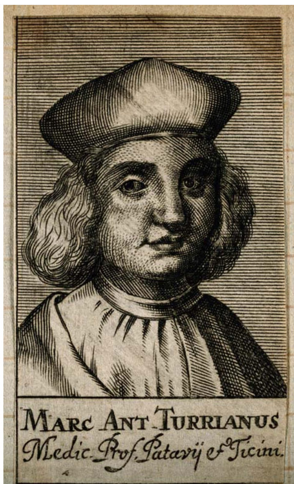
Figure 2. Marc Antonio della Torre (Turrianius). Line engraving, 1688.