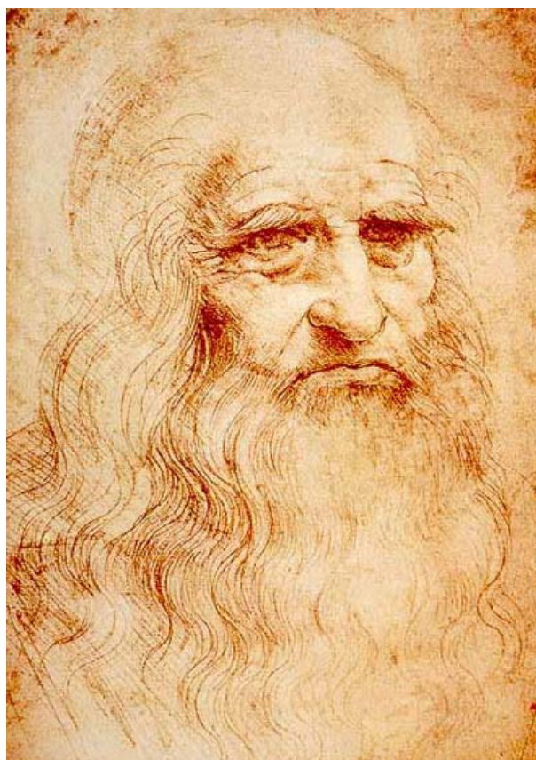
Figure 1. Leonardo da Vinci. Self portrait (circa 1515, Royal Library, Torino)