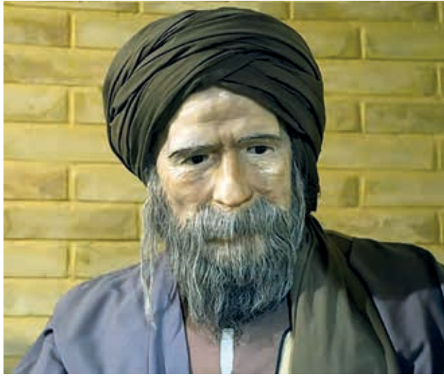
Figure 1. The statue of Quṭb al-Dīn Shīrāzī , Zinat al-Moluk House , Fars fame museum, Shiraz.

Slika 1. Skulptura Quṭb al-Dīn Shīrāzīa, Zinat al-Moluk kuća, Muzej slavnih iz Fars provincije Fars, Shiraz.