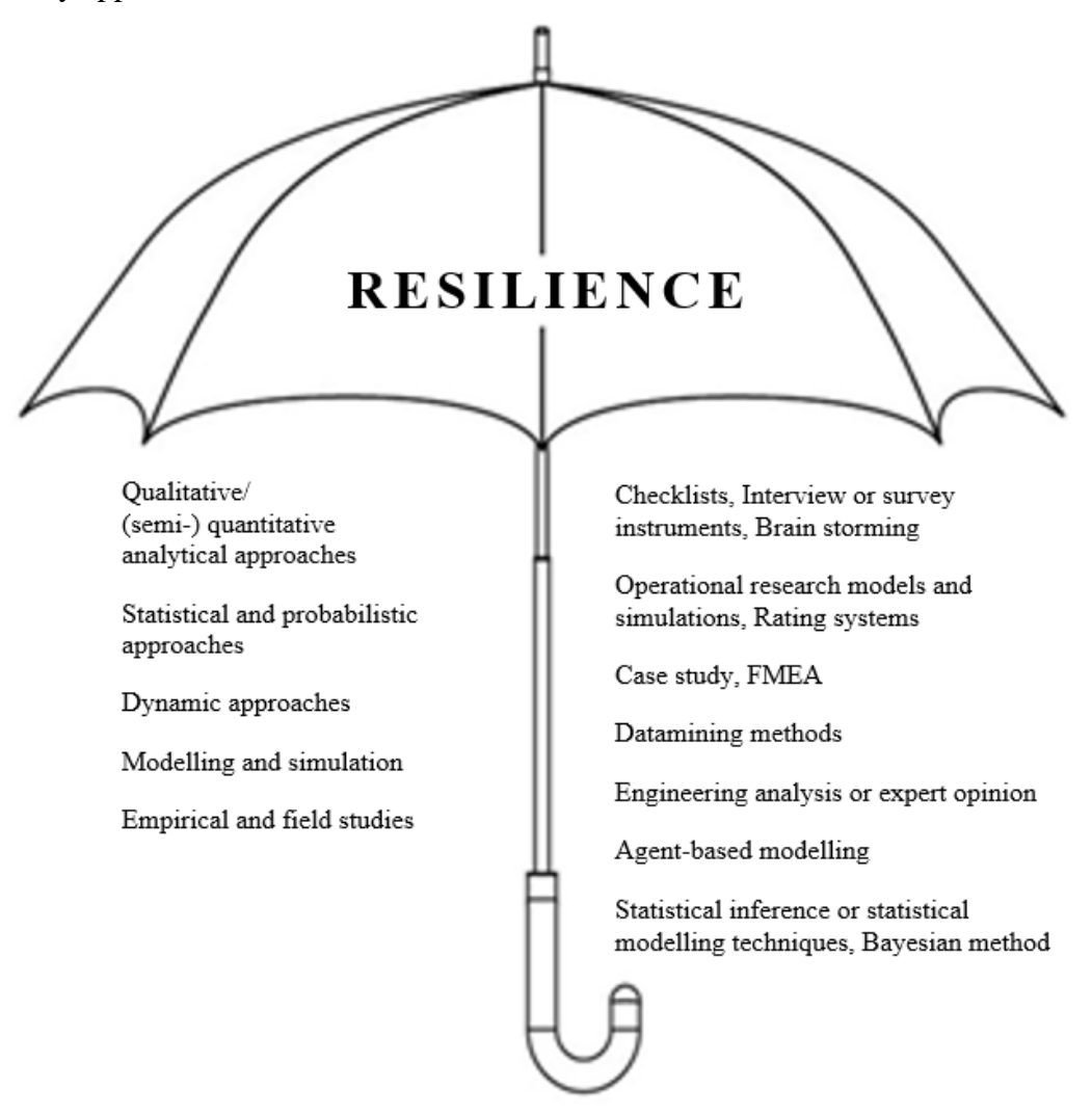
Figure 2. Approaches and methods (techniques) to resilience assessment.

methods for risk assessment, some of which are widely applied in terms of risk identification, evaluation and assessment, while others only focus on a certain risk assessment phase. From all of these methods, it is necessary to point out the FMEA (Failure modes and effects analysis) – which is a widely used method, applicable in all situations which can be used to identify significant number of errors within a system. There are no standardized approaches, methodologies and techniques for the evaluation of resilience, nor is a standardization of these methods foreseen in the versions of the ISO norms currently under development. In the literature authors list several methods to be used in different steps in the development of resilience management systems. Based on the literature reviewed, Figure 2, located below, provides approaches and methods for different steps which are considered to be relevant and potentially applicable for resilience assessments.