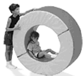
4 Prisvajanje i razmjena dobara