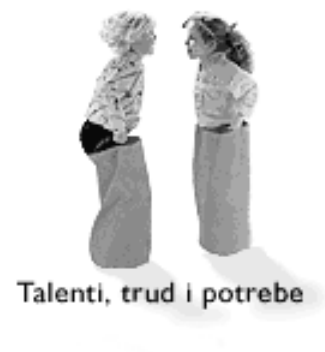
Talenti, trud i potrebe