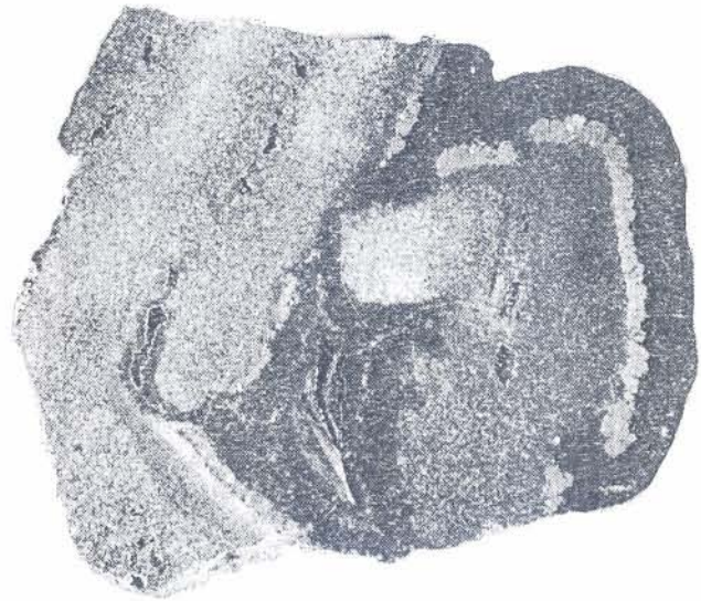
Fig. 3 Schalenblende-Zn crustifications built of sphalerite paramorphoses after wurtzite with shadow layer of galena. Isotope temperature ca 300 °C. Trzebionka Mine, Ore-bearing dolomite level. Reflected light, 1/2 natural size.

In the second zone, the horizontal system of hydrothermal karst caves filled with ore crustifications of dolomitic collapse breccia are the dominant ore-type in the Triassic level, however an uniform hydrothermal karst system is including also a vertical and less horizontally extended hydrothermal karst system of caves developed a few hundred meters deeper in