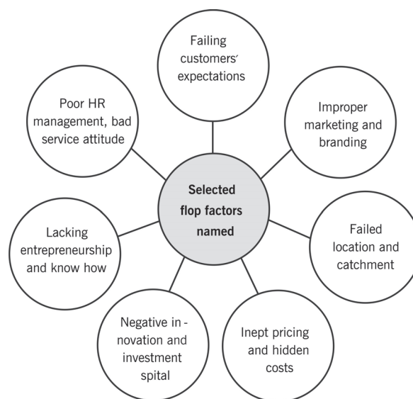
Figure 2 SELECTED FLOP FACTORS OF THEME PARKS

One of the most mentioned arguments were that failing theme parks do not meet and dissatisfy customers’ expectations. This means e.g. that the product delivered gaps the description of the product, the product misses authenticity, credibility experience and adventure, the customer gets bored and misses a certain wow-factor and the park lacks of repetitive visits. As important as the right service to customers’ expectations were valued marketing issues in general. Failing parks do miss the right and appropriate marketing concept, a wrong or non existent branding, wrong defined target groups and a lack of mouth-to-mouth propaganda. As a third point, the wrong location of the park was named as a flop factor. A wrong location implies also the missing catchment area as well as underdeveloped or missing transport connection and infrastructure. The interviewees did consider not appropriate pricing as a fourth point of failure. Here, the