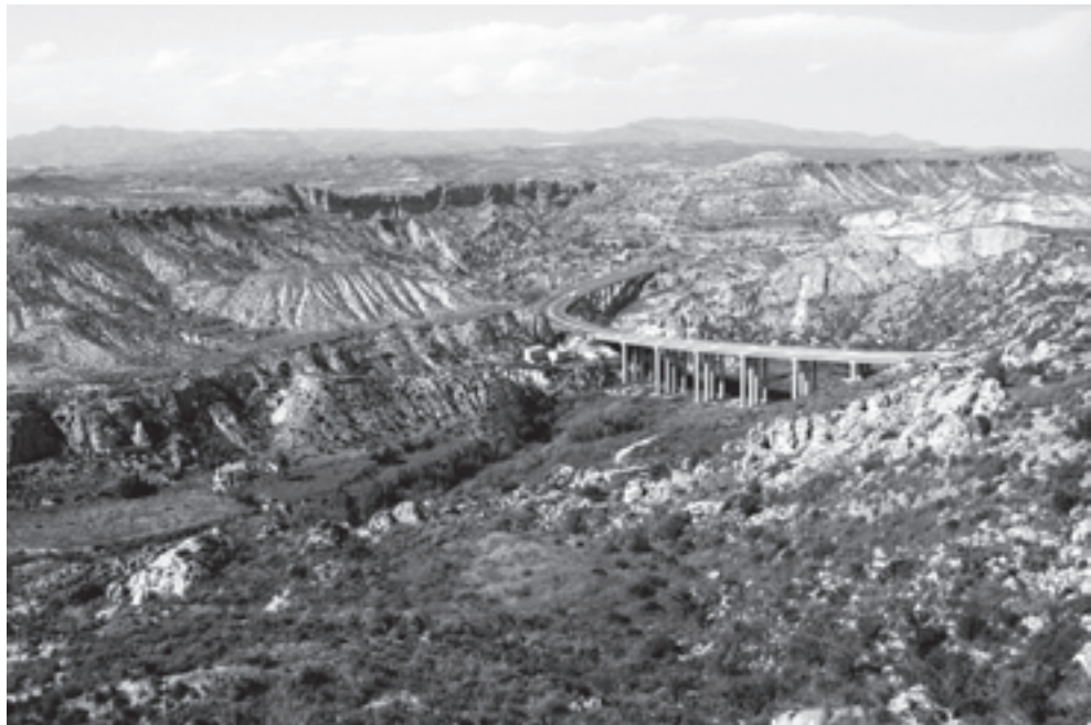
Figure 5 SORBAS GYPSUM KARST NATURAL PARK**

** The sparse scrub vegetation is indicative of the limited surface water. Old gypsum mine working and their spoil heaps can be seen to the left of the modern road bridge.