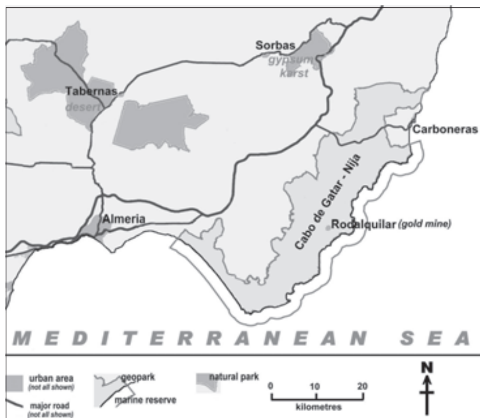
Figure 3 ALMERIA GEOSITES LOCATION MAP