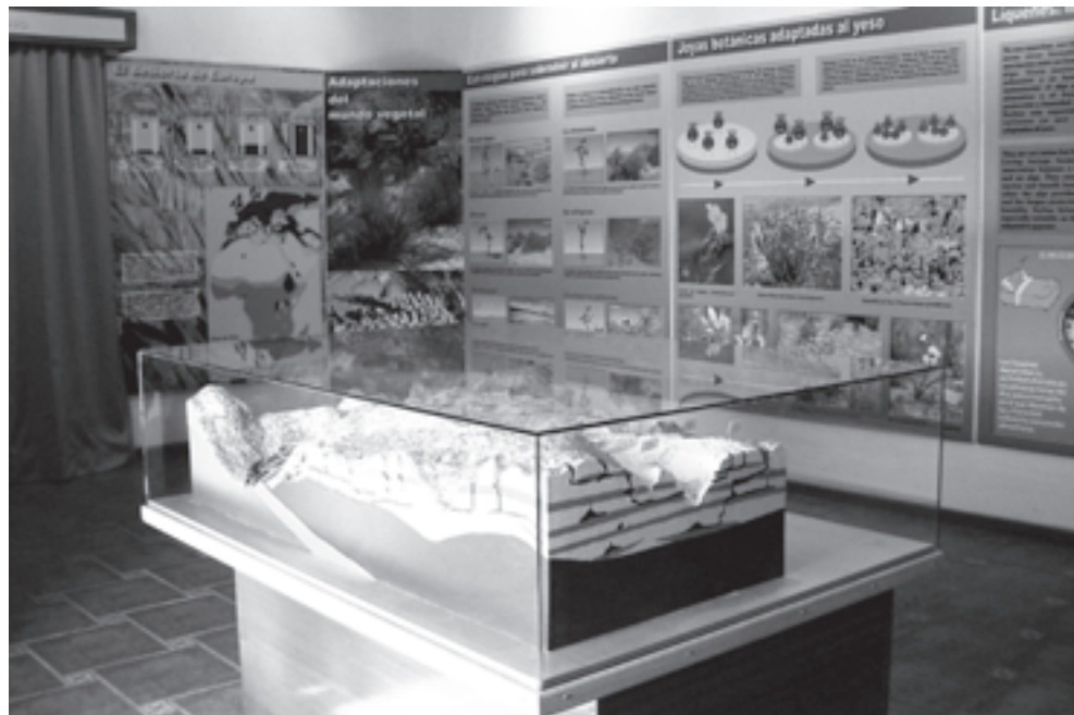
Figure 10 SORBAS MUSEUM GALLERY*

* One of the museum's galleries; the wall panels describe the areas plants and their adaptations to the harsh environment whilst the model in the foreground shows a section through the gypsum karst with its caverns and sinkholes.