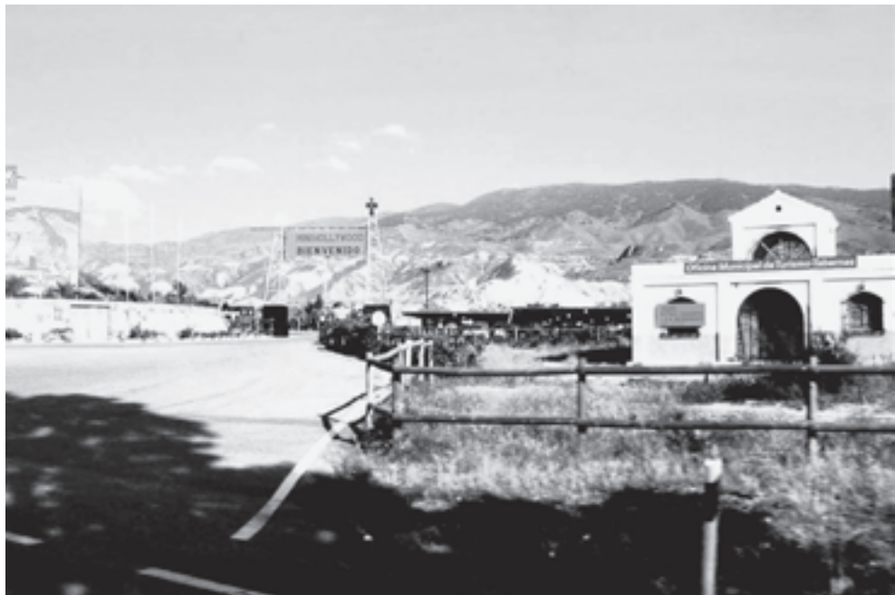
Figure 7 MINI-HOLLYWOOD NEAR TABERNAS*

* This cinema studio has some of the film sets, now used for re-enactments, employed in making 'westerns' and a small zoo.