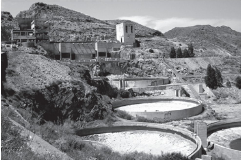
Figure 8 RÓDALQUILAR GOLD MINES*

* The extensive but derelict gold mines and the treatment plants (such as the circular settling tanks in the middle of the view) require considerable restoration to make them safe for casual geotourists. There are several information panels around the site.