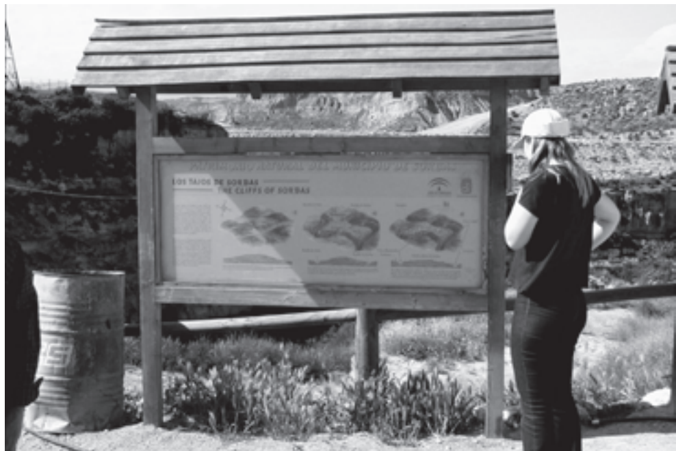
Figure 9 SORBAS MUSEUM PANEL**

** The panel outside the museum explains the formation of the karst landscape; its roof provides some limited shade from the heat of the Sun.