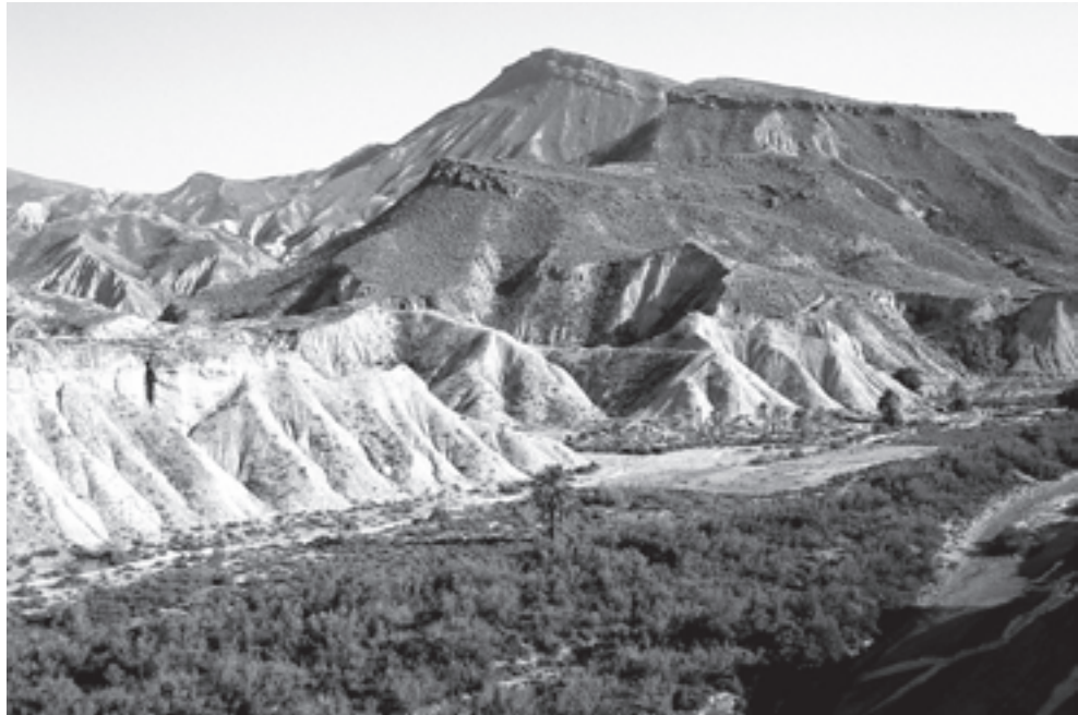
Figure 6 TABERNAS NATURAL PARK**

** The hills covered with sparse vegetation and the seasonally dry river bed, with trees such as the date palm, are typical of this semi-desert or 'bad-lands' area; the similarity to the southern United States and northern Mexico were well exploited from the 1960s for the filming of 'westerns'.