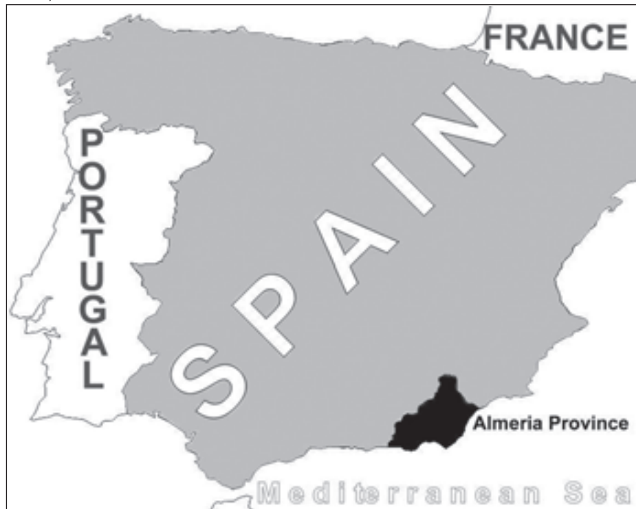
Figure 2 SPAIN, ALMERIA PROVINCE LOCATION MAP

It has a combined bus and railway station – trains make the journey to Granada in just over two hours and direct services are also available to Madrid. Buses run to Grenada, Barcelona, Malaga and Valencia.