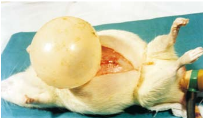
Fig. 5. Rupture of the abdominal wall. The arthrotome connected with trocar and covered with the balloon was placed through the perforated rectum in the abdominal cavity. A nylon cord was tied around the lower abdomen to prevent inguinal herniation.