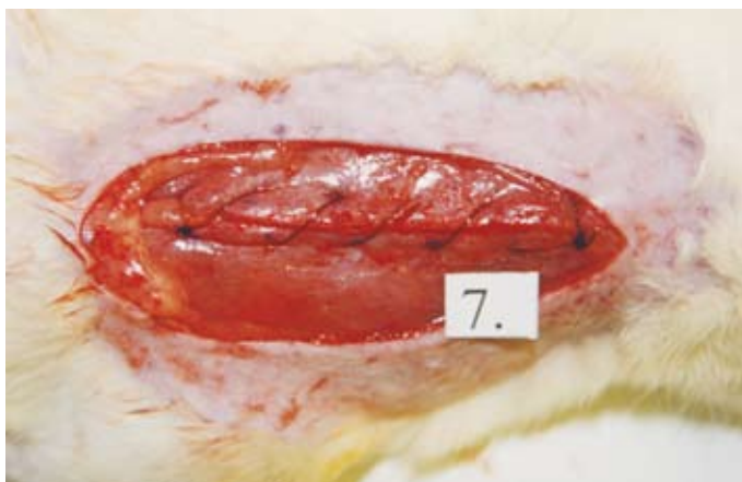
Fig. 2. SCS technique after midline laparotomy closure