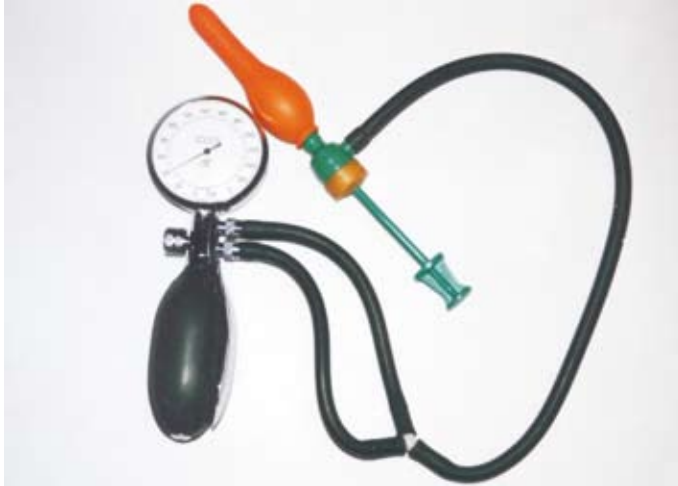
Fig. 4. Modification of classic blood pressure manometer connected to the arthrotome and balloon used for measurement of intraabdominal pressure.