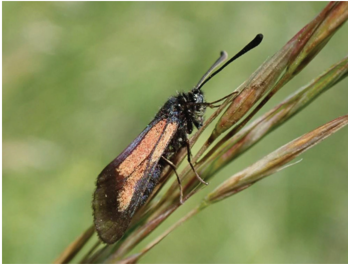
Fig. 2. Zygaena brizae from Prijeboj, Plitvice Lakes National Park, 16.6.2021.