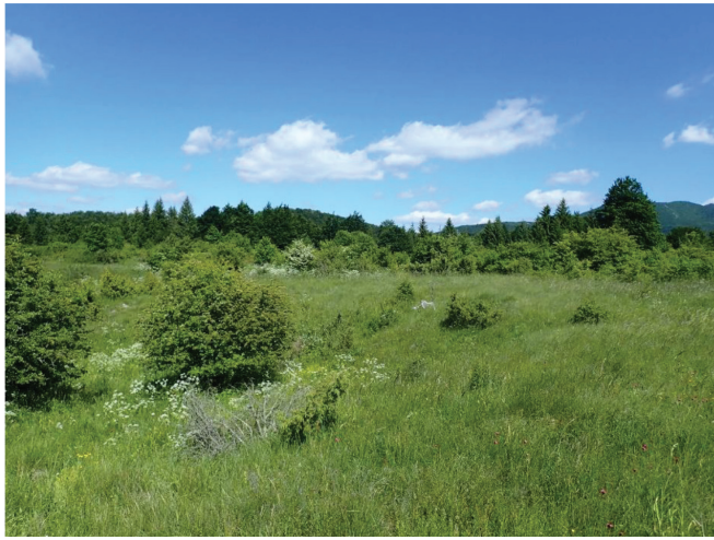
Fig. 4. Habitat of Zygaena brizae at Prijeboj, Plitvice Lakes National Park, 16.6.2021.

road. These meadows are also on limestone substrate, and cover a rather large continuous area. Some parts of these meadows are still used as pastures