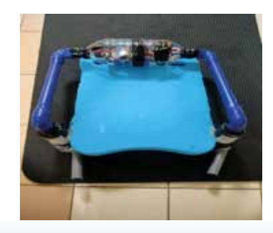
Figure 3. Prototype Y.

minute (rpm) and a torque of 350g-cm at a maximum efficiency. The 775 DC motor has been chosen due to its characteristics of high speed (torque).