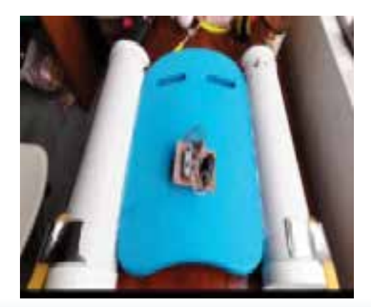
Figure 2. Prototype X.

Figure 2 shows Prototype X, developed from kickboard, polyvinyl chloride (PVC) pipe, rubber hose, and electronic components. In this prototype, the Arduino board and electronics components have been located on the left side of the white coloured PVC pipe to ensure the electronics components sealed from contact with water. The thrust for Prototype X is achieved through the differences in water pressure created by the water pump through a water inlet rubber hose under the PVC pipe and water outlet at the upper rubber hose.