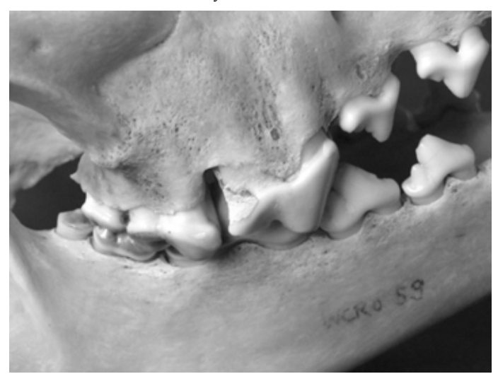
Fig. 3. Periodontitis with signs of alveolar bone loss in alveoli of forth maxillar premolar with a complicated crown-root fracture and deposit of calculus on the same tooth, buccal view, in wolf N° WCRO 59, 5.4-year-old female

Fig. 2. Initial stage of caries on the occlusal surfaces of the maxillar molars in wolf N° WCRO 59, 5.4-year-old female