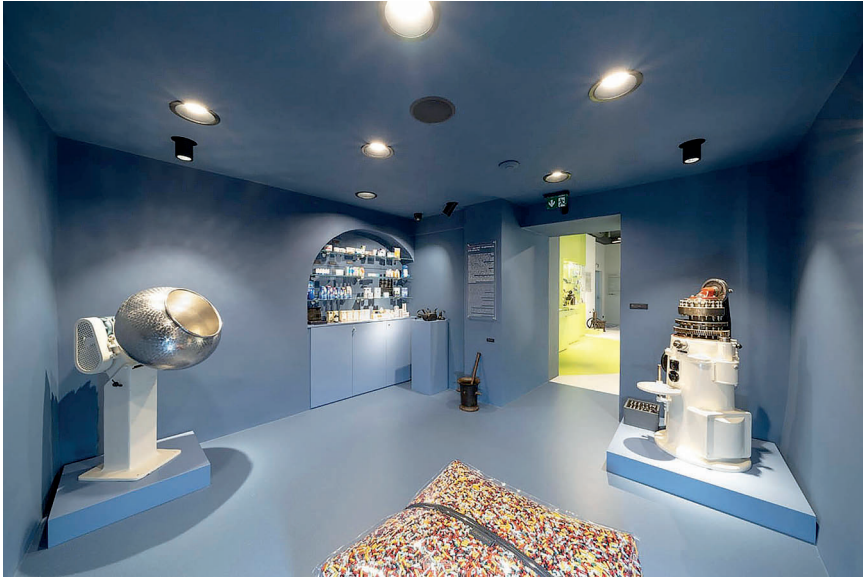
Figure 1. Exhibition unit dedicated to the founder of the museum, the Adriatic-Galenic Laboratory.