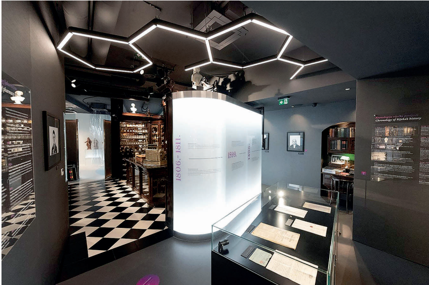
Figure 2. Museum interior: one of the main tasks of the project team was to find a quality balance between historical and modern and thus satisfy all categories of visitors.