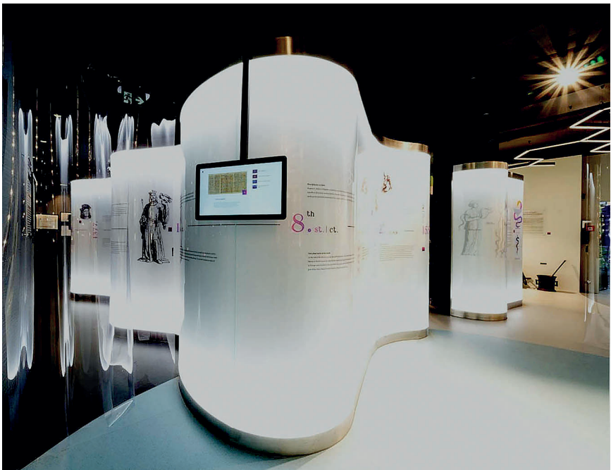
Figure 4. The timeline with 18 important events in the history of pharmacy is as long as 20 meters.