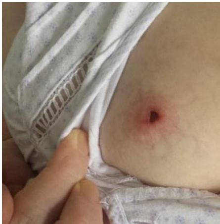
Figure 5. Ulcerative skin lesions on breasts

The serologic studies for infectious etiology included herpes simplex and zoster viruses, cytomegalovirus, Epstein-Barr virus, Treponema pallidum , Borrelia burgdorferi , tuberculosis, or human immunodeficiency virus infection were negative. Pathohistological findings of nostril skin, right eyelid, and normal buccal mucosa again showed unspecific skin granulomatous changes and normal mucosa. Once again, corneal and multiple skin lesion cultures from the right eye were positive to E. faecalis . Initially, the same fortified antibiotic therapy was given to her as previously described for the left eye, and amniotic membrane transplantation was performed. Unfortunately, she developed right eye endophthalmitis (Figure 7). The anterior chamber and vitreous humor culture were also positive to E. faecalis . PCR of aqueous humor was negative to HSV 1, HSV 2, and VZV. Treatment included topical fortified vancomycin, ampicillin, intravenous and intravitreal antibiotics according to antibiogram.