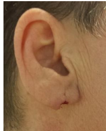
Figure 6. Right earlobe tissue defect most likely caused by self-injury

The serologic studies for infectious etiology included herpes simplex and zoster viruses, cytomegalovirus, Epstein-Barr virus, Treponema pallidum , Borrelia burgdorferi , tuberculosis, or human immunodeficiency virus infection were negative. Pathohistological findings of nostril skin, right eyelid, and normal buccal mucosa again showed unspecific skin granulomatous changes and normal mucosa. Once again, corneal and multiple skin lesion cultures from the right eye were positive to E. faecalis . Initially, the same fortified antibiotic therapy was given to her as previously described for the left eye, and amniotic membrane transplantation was performed. Unfortunately, she developed right eye endophthalmitis (Figure 7). The anterior chamber and vitreous humor culture were also positive to E. faecalis . PCR of aqueous humor was negative to HSV 1, HSV 2, and VZV. Treatment included topical fortified vancomycin, ampicillin, intravenous and intravitreal antibiotics according to antibiogram.