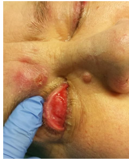
Figure 2. Papillary reaction and scarring of tarsal conjunctiva. Typical skin lesion on the base of the eyelashes

When the left cornea showed substantial improvement, she was referred to the ophthalmologist in her hometown and recommended to use local antibiotics