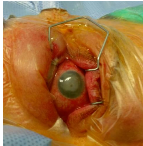
Figure 7. Corneal ulcer and hypopyon of the right eye due to development of endophthalmitis

All these findings, negative biopsies, and E. faecalis positive cultures, once again, led us to suspect combined mechanical and infective damage of corneas and skin due to constant rubbing and scratching of her eyes and skin with unclean hands. However, the patient vehemently denied this behavior. Psychiatric care was also provided, she was diagnosed with the anxiety-depressive disorder, and appropriate therapy was administered. No signs of other psychiatric disorders and dissociated behaviors were found, while the patient denied them. She was discharged from the hospital after the resolution of eye inflammation. A thorough psychiatric assessment was recommended to be done in her hometown, but she ignored it. Later on, her BMI increased to 65 kg/m 2 , which made her immobile.