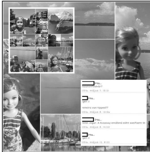
Figure 1. Photo montage from the online game.