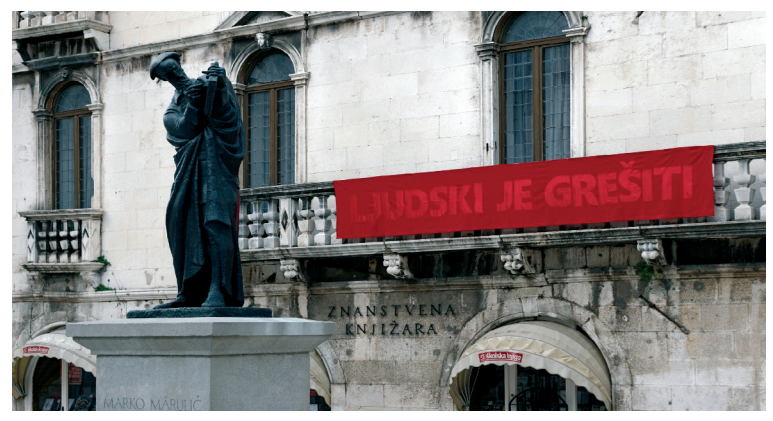
Installation by the artist Mak Hubjer at the Milesi Palace in Split on the occasion of the exhibition Work, Text, Context (because Error is a Part of Consciousness)

The third edition of the exhibition Work, Text, Context (because Error is Part of Consciousness) was held in the Milesi Palace in Split and at two locations in Zagreb: the SC Gallery and the French Pavilion. The exhibition represents a kind of continuity of cooperation launched in 2017 entitled Work, Text, Context (Forms of Collaborative Practices) and cooperation in 2019 entitled Work, Text, Context (Exhibition that Hears You) . The project was intended to connect students from the two faculties and launch the practice of a joint biennial exhibition.