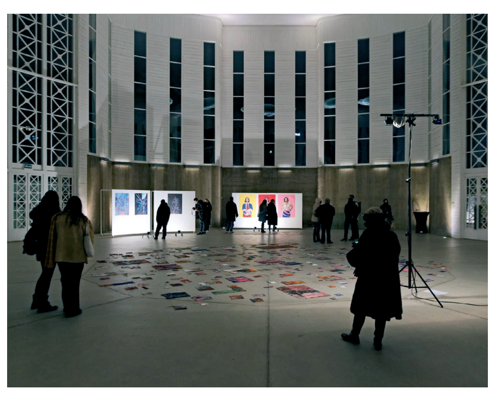
Part of the exhibition Work, Text, Context (because Error is Part of Consciousness) held at the French Pavilion in Zagreb in 2022

The small number of students of the Department of Art History also meant that they would collaborate with as many as three young artists, who in their diversity through conversations and separate achievements each posed a special challenge and thus a kind of insight into their future challenges. The communication that took place during the writing of the accompanying texts about the works, as well as during the entire holding of the exhibitions, emphasized the importance of simultaneously achieving the goals and generating common ideas. With this collaboration, the students of the Faculty of Humanities and Social Sciences in Split were given a unique opportunity to apply the theoretical knowledge learned so far, and the collaboration with the students from the Academy of Arts in Split gave new light and perspective for thinking about work and artistic activity.