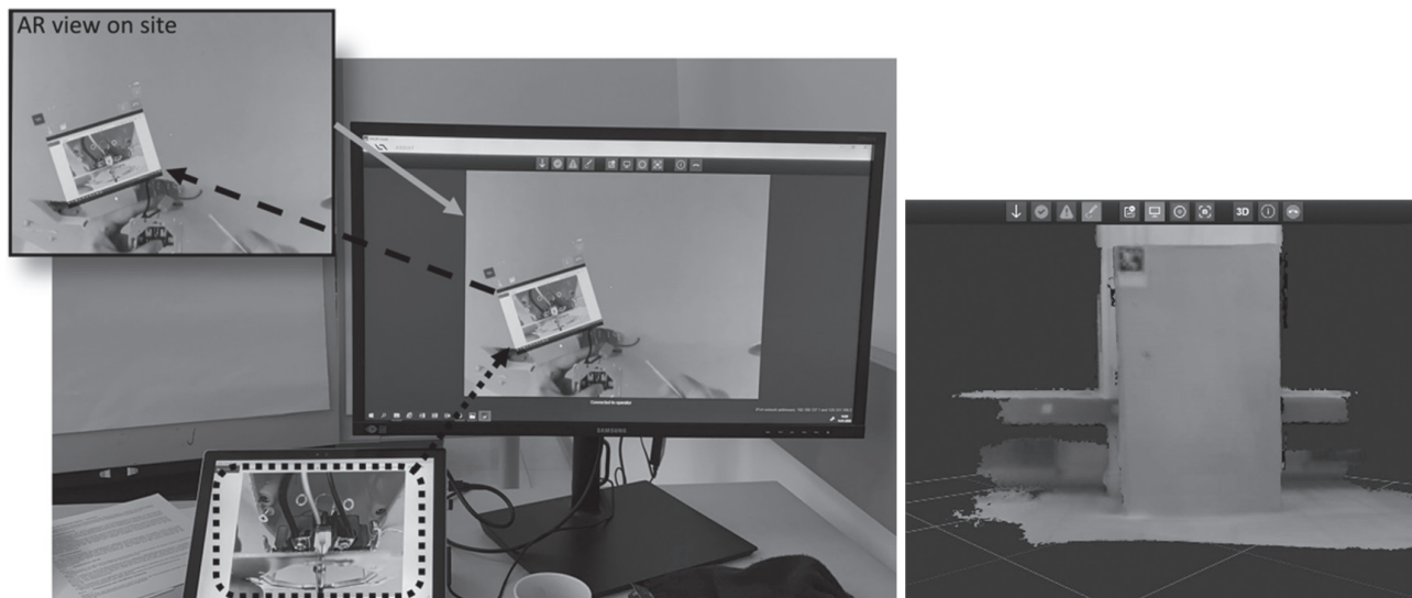
Fig. 1: Remote site inspection with a remote expert system (Schranz et al. 2020).