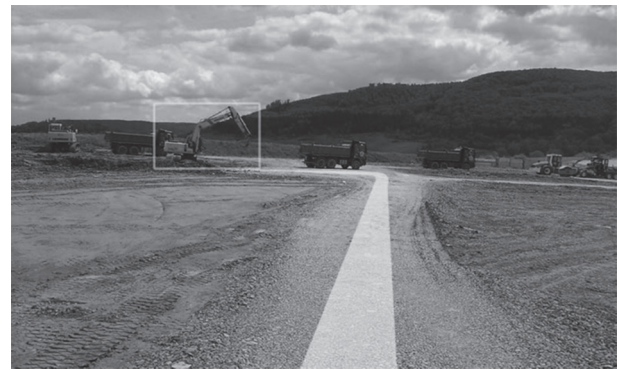
Fig. 5: On-site navigation for excavator driver (Kirchbach 2014).

The information projected onto the driver’s field of view can also display and outline the proposed excavation area (UC21). This use-case adds the capability of removing intermediaries from activities (C3). It can educate the