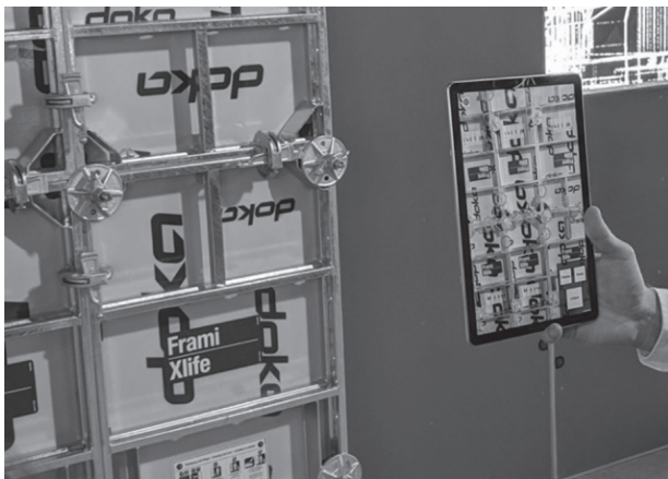
Fig. 3: Doka verification buddy: Visualization of augmented work instructions in the field in combination with AI. AI, artificial intelligence.

Another AR application is on-site navigation for the logistics of construction equipment. This application supports the on-site navigation use-case (UC10) and assists the