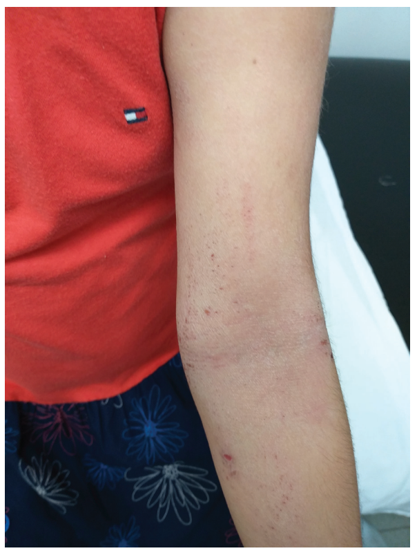
Figure 1. Atopic dermatitis. Female teenager with generalized xerosis and poorly defined erythematous plaques in the forearm fold with scratching stigmas and some excoriations. Photograph taken by patient during dermatology consultation.

It has also been said that having vitamin D deficiency is a risk factor for AD, and although the