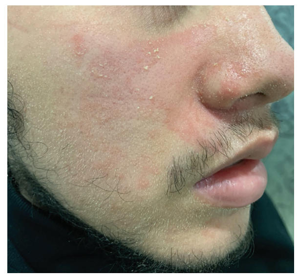
Figure 5. Seborrheic dermatitis. Young man with well-defined irregular erythematous plaques with yellowish-white oily scaling located in the nasolabial folds, cheeks, and skin of the upper lip. Photograph taken by patient during quarantine and sent for teleconsultation with dermatology specialist.

on psoriasis is so important that a weight reduction may improve patients' lesions (23). This should be taken into account due to the already mentioned significant weight gain in people during COVID-19 quarantine (19,74).