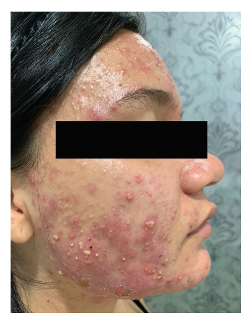
Figure 2. Acne. Young female patient with several papules, pustules, and erythematous plaques on the forehead, chin, and cheeks, as well as closed comedo on the forehead and cheeks. Some ice pick scars on the cheeks. Photograph taken by patient during quarantine and sent for teleconsultation with dermatology specialist.

evidence on the association is still contradictory, it is worth mentioning given the low exposure to sunlight during quarantine. The majority of the literature suggests a negative correlation between the severity of AD and vitamin D levels; it was found that moderate and severe AD groups had lower vitamin D levels compared with the mild AD group. It has been suggested that vitamin D ameliorates AD lesions by normalizing the altered innate immune response, inhibiting the allergic response and restoring defects in the epidermal barrier (25).