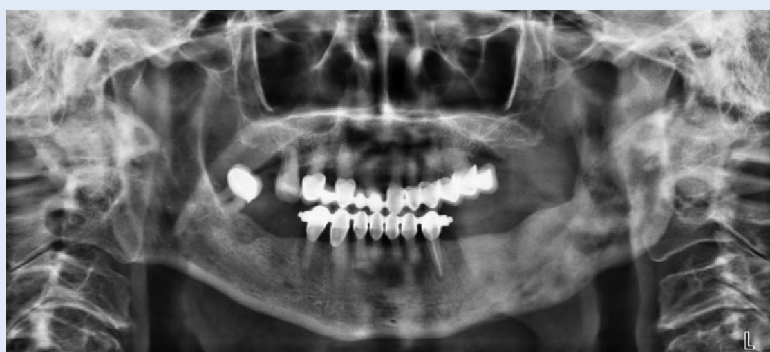
Figure 2. Orthopan showing the condition after impacted tooth extraction. Note the lesion involving left mandibular corpus, angle, and ascending ramus of the left mandible.

due to the recurrent painful symptoms with pain intensity 8\10 on the pain scale. A combination of acupuncture treatment and pain medications were administered as well as the recommendation of neurological and otorhinolaryngological examination because of the possible trigeminal neuralgia diagnosis. Within a 2 year period, her symptoms progressed to the point where her left side of the face was visibly enlarged and swollen. The patient was noticeably thinner due to the poor food intake. In December, 2018 the panoramic radiography confirmed left mandibular jaw lesion 2 x 2 x 0.3 cm 3 with ill-defined margins and long transition zone (Figure 2). The computed tomography (CT)