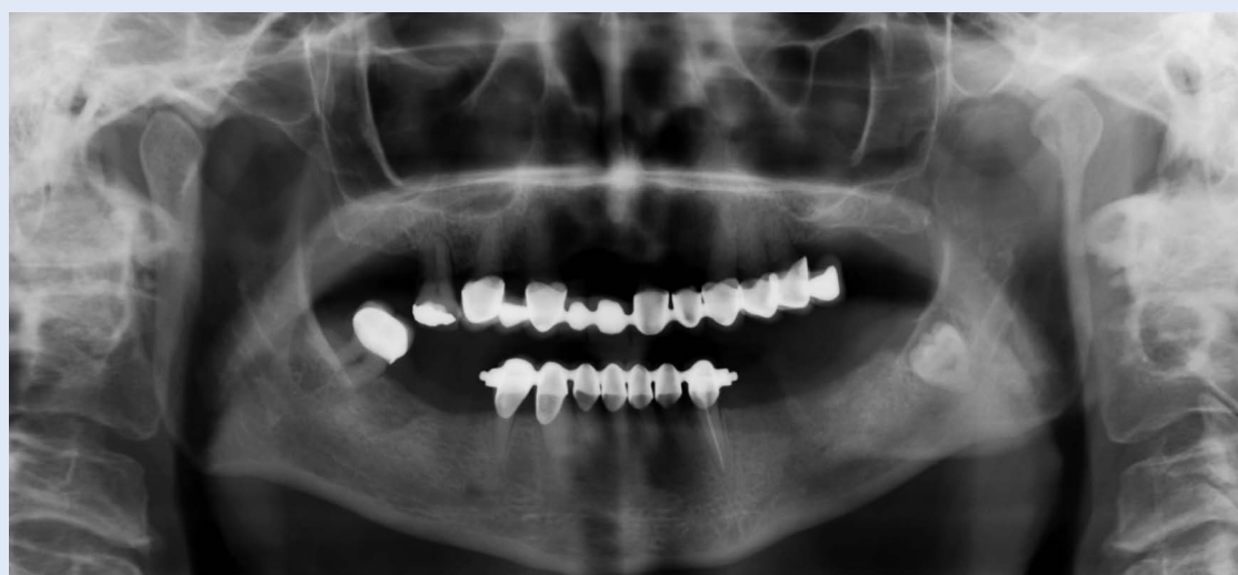
Figure 1. Orthopan showing the condition before impacted tooth extraction.

nary disease (COPD). She was a heavy smoker for about 50 years with no history of alcohol or drug abuse. Since there was no clinical improvement in symptoms after tooth extraction, and physical examination revealed persistent pain and tenderness of the temporomandibular area, the patient was referred for further diagnosis. The patient underwent MR and arthroscopy in 2014 which indicated disc perforation of the left TMJ with osteophytes and extensive degenerative changes. Initial diagnosis was temporomandibular disorder. Arthrocentesis was performed, which resulted in significant clinical improvement that lasted for 1.6 years. The patient was evaluated again in 2016