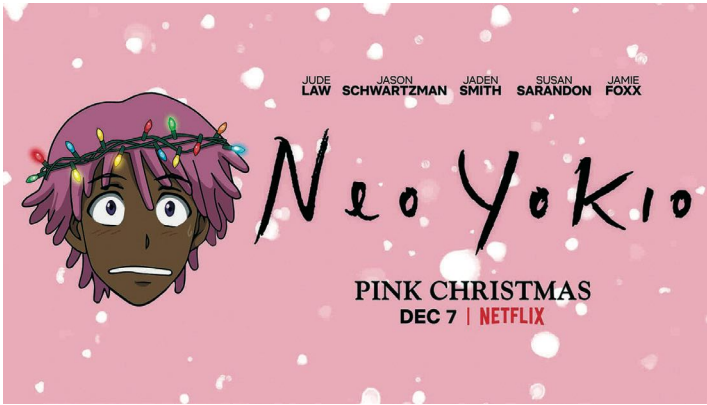
Fig. 10. Christ-like Kaz on the cover of Pink Christmas (screen shot / fair use)

Great Demon: What was here before Neo Yokio?