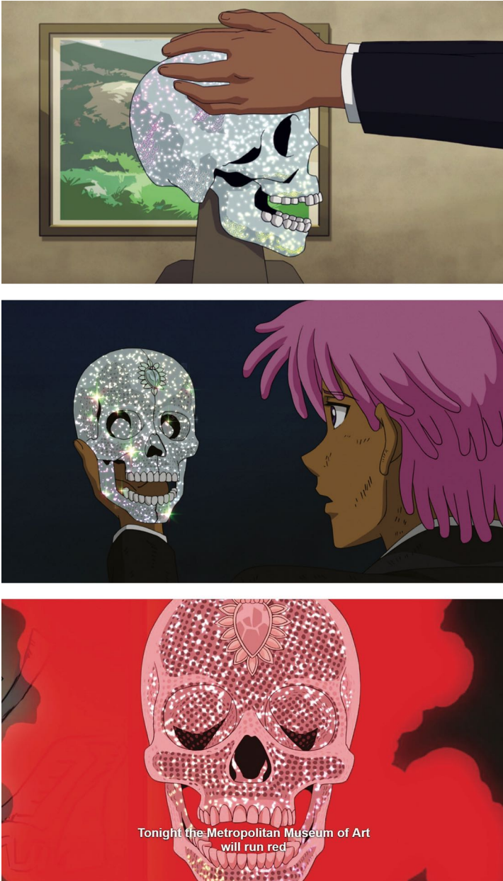
Fig. 3. For the Love of God by Damien Hirst, as visualized in Neo Yokio series (screen shot / fair use)