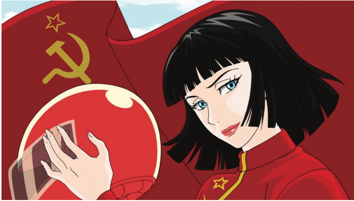
Fig. 5. Mila Malevich as a Formula 1 driver (screen shot / fair use)

they'd seen the show, but then I thought about everything that's in the show and... nah, they're not gonna like it. 41