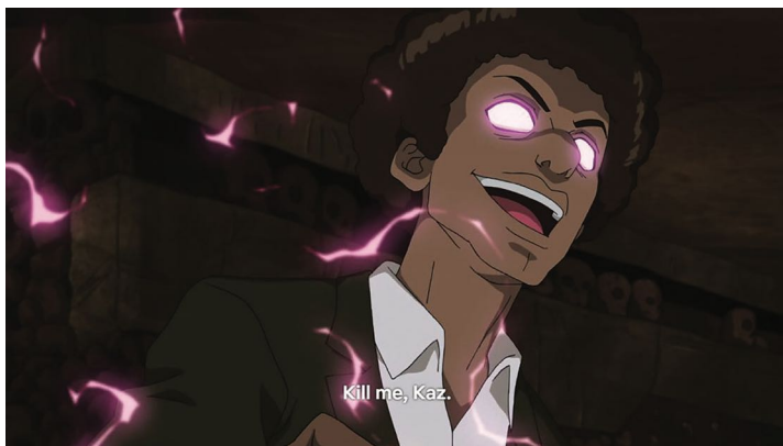
Fig. 9. Possessed Herbert the Salesclerk (screen shot / fair use)

Salesclerk (his name is revealed only in the Special) he saved from the attempted suicide after being sacked. The showdown takes place in what seem to be Neo Yokio catacombs. Kaz needs to kill the possessed Salesclerk (Fig. 9) in order to bring the Great Demon on surface for only the magistocrats have the power. Kaz can't do it so Aunt Agatha, merciless towards the socially inferior, does. Salesclerk starts bleeding pink and the entire megalopolis is flooded with pink, the colour we learn more about from Demon's words to Kaz: