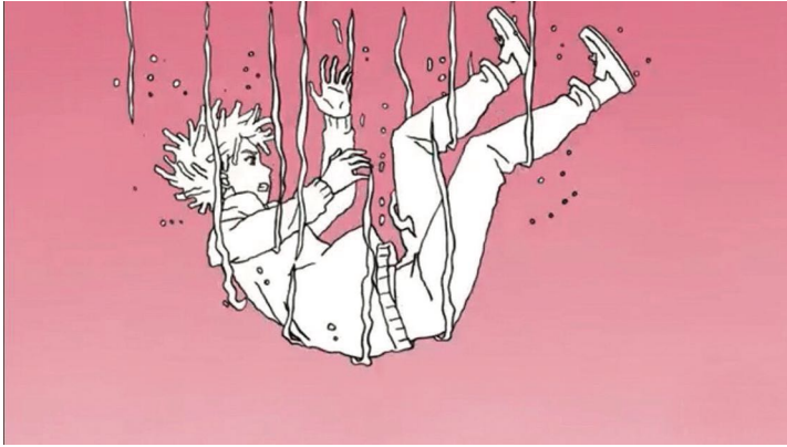
Fig. 7. Kaz is falling into the pink void (screen shot / fair use)

episode opens with shop windows and the restored Bachelor board), and Neo Yokio indulges in its rituals (“ Charles : Come, sir, there’s more to the holidays than shopping and seasonal beverages. Kaz : Is there, Charles ?”), but Kaz Kaan has a flu and his mecha-butler starts reading the Old Testament but gets interrupted by Kaz who refuses it in a quasi-revolutionary gesture 46 and the robot starts a Christmas Carol -like tale, a “bespoke story, something tailor made for a man of your exquisite taste” which becomes Kaz’s dream as he falls asleep.