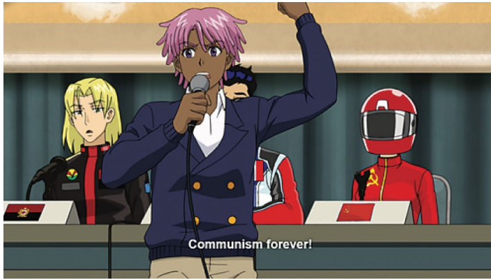
Fig. 6. The Communist Kaz is giving a talk (screen shot / fair use)

might be on the right side. 42 The turning point takes place during the race when Kaz's races through the forbidden part of the city hiding Helena in his car 43 after protecting her dressed as Mila Malevich in the press conference 44 (Fig. 6) and sees the impoverished and exploited parts of the city (the aforementioned Salesclerk lives there). The final episode of the season closes on Kaz's unsettling thoughts 45 announcing the revolutionary change of the special.