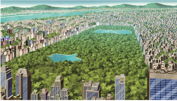
Fig. 1. Aerial view of the city of Neo Yokio (screen shot / fair use)