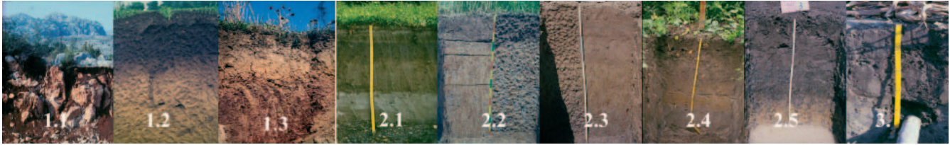
Figure 2. Hydropedological units according to soil moistening mode by surface and/or groundwater within 2 m depth: excessively drained type (1.1.), well drained type (1.2.), moderately well drained type (1.3.), alluvial type (2.1.), pseudogleyic type (2.2.), pseudogley-gleyic type (2.3.), hypogleyic type (2.4.), amphigleyic type (2.5.), hydroameliorated type (3)