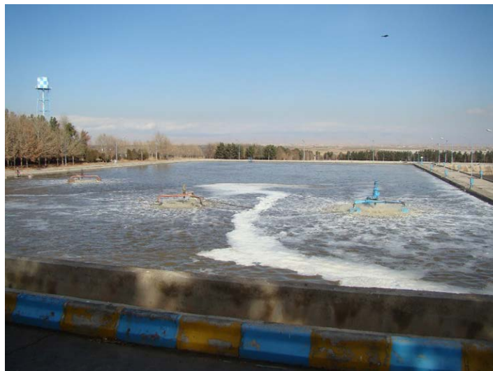
Figure 1. Perkandabad wastewater treatment plant

One of the most important municipal wastewater treatment plants in Mashhad is Perkandabad wastewater treatment plant No. 1 (Figure 1), which is located on the southern bank of the seasonal river. The nominal capacity of this treatment plant is 15,200 cubic meters per day and the population covered by it is 100,000 residents. The treatment process used in this treatment plant is an aerated lagoon with complete mixing, and the raw wastewater is treated by passing through the waste collection unit, aeration lagoons, sedimentation ponds, execution pond, and disinfection unit. Due to the discharge of effluent from the Perkandabad No. 1 treatment plant into the river at certain times of the year, the design of this treatment plant is based on surface water discharge.