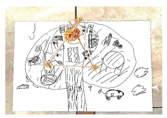
Figure 2: Architecture and drawing, asymmetry, skeletal spatial formation — "My dwelling on an alien planet": discernible progress of the student in the completion of the artwork and the complexity of its production (as a consequence, the student showed increased perseverance, attention, and concentration). Without difficulty, he was able to independently and convincingly show the peculiarities and details in connection with the motif and improve his motor skills.

In addition, we also attribute the student's progress in the areas of perseverance, attention, and concentration to the way our intervention was organised. The sessions were regular and intensive, and the entire programme, which took place over twelve sessions, was constantly monitored and evaluated. We made sure to identify ways in which the student can participate as actively as possible. The one-to-one work quickly created a circle of confidentiality, which was a prerequisite for promoting individual progress in terms of perseverance, attention, and concentration. Working