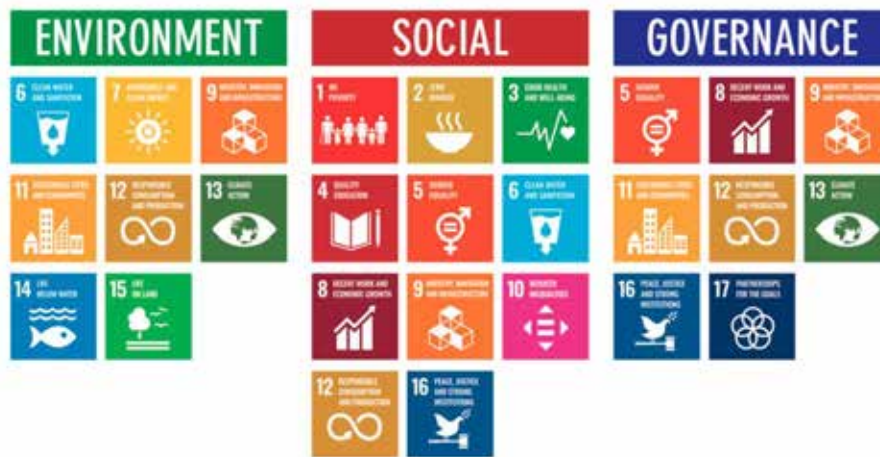
Figure 1: SDG through the lens of ESG