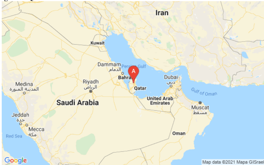
Figure 2: Qatar Geolocation