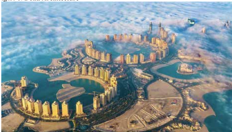
Figure 1: Doha Architecture