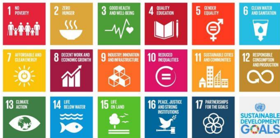
Figure 3: UN Sustainable Development Goals