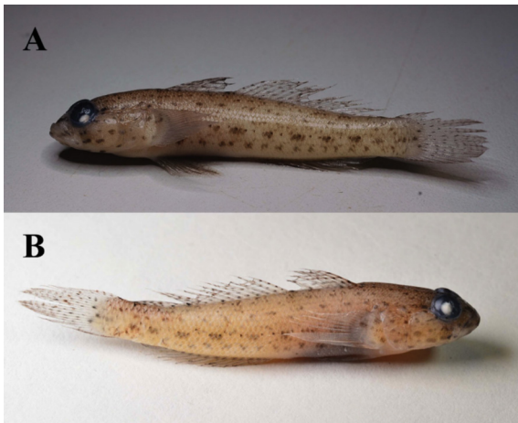
Fig. 2. Gobius incognitus , A) male, 44.7 + 10.3 mm, PMR VP5183; B) male, 40.1+8.3 mm; San Lowrenz, Gozo island, Malta, photographs by M. Kovačić (A) and O. Kotvun (B)

head canals present; 3) anterior dorsal row g of sensory papillae ends behind or on lateral end of row o ; 4) six suborbital transverse row c of sensory papillae, if seven, then predorsal area scaled.