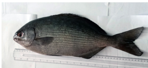
Fig. 2 Kyphosus vaigiensis collected from the coast of Libya

Body oblong, moderately deep, its depth 40.1% in SL, small head (21.4% in SL). Small mouth, its jaws terminate at the vertical of interior of eye. Snout length slightly larger than eye diameter. Dorsal fin with IX-X spines and 13-14 rays; Anal fin with III spines and 12-13 rays; Pectoral fin short with 18-19 rays. Pelvic fin origin behind pectoral fin origin with I spine and 5 rays. Caudal fin forked. Color: Body brownish-grey. Back dark, becoming lighter on the ventral surface. Thin horizontal lines on the flank. The posterior margin of the operculum and all fins slightly darker than rest of the body.