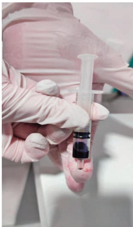
Figure 1. Dark brown blood color of a patient with methaemoglobinaemia.