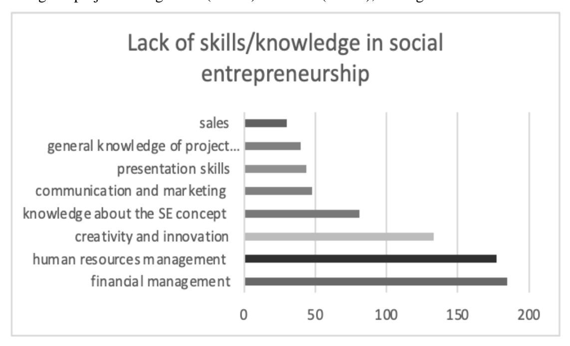
Figure 1. Key skills/knowledge employees in social entrepreneurship lack.