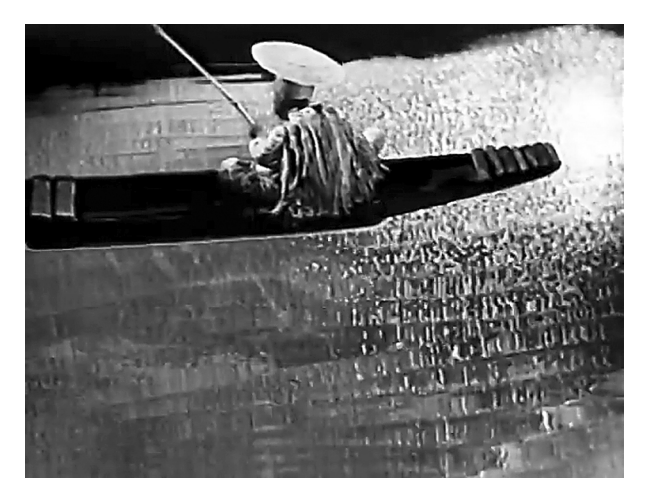
Figure 5. A still from the 1949 Czech stop-motion puppet animation film The Emperor's Nightingale (Císařův slavík) by the acclaimed animator Jirí Trnka that made a great impression on Bohm and influenced his view on the 'qualitative infinity of nature'.

"what I was trying to say in the book", and which "has sort of stayed with me since then".<sup>184</sup>