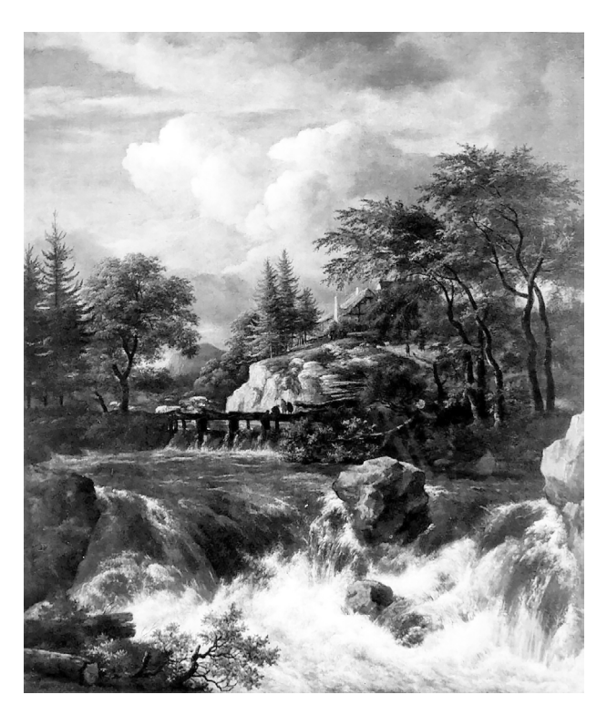
Figure 4. A Waterfall in a Rocky Landscape (c. 1660), oil on canvas, by the seventeenth-century Dutch painter Jacob van Ruysdael, which greatly impressed and inspired Bohm as a masterful art depiction of dialectical processes of movement and permanence. From: National Gallery, London, UK, available at: <u>https://www.nationalgallery.co.uk</u>, public domain (CC BY-NC-ND 4.0).

phrase Bohm would abundantly use throughout the rest of his life, he had with natural phenomena like whirlpools and vortices in water and air, in which he was interested "already from watching them in the bathroom or somewhere else" at an early age and also from reading about tornadoes.<sup>172</sup> In particular, what struck the imagination of young Bohm was a coexistence of, on the one hand, the apparent relative constancy, independence, and stability of these phenomena but, on the other hand – at deeper levels – their rather violent and