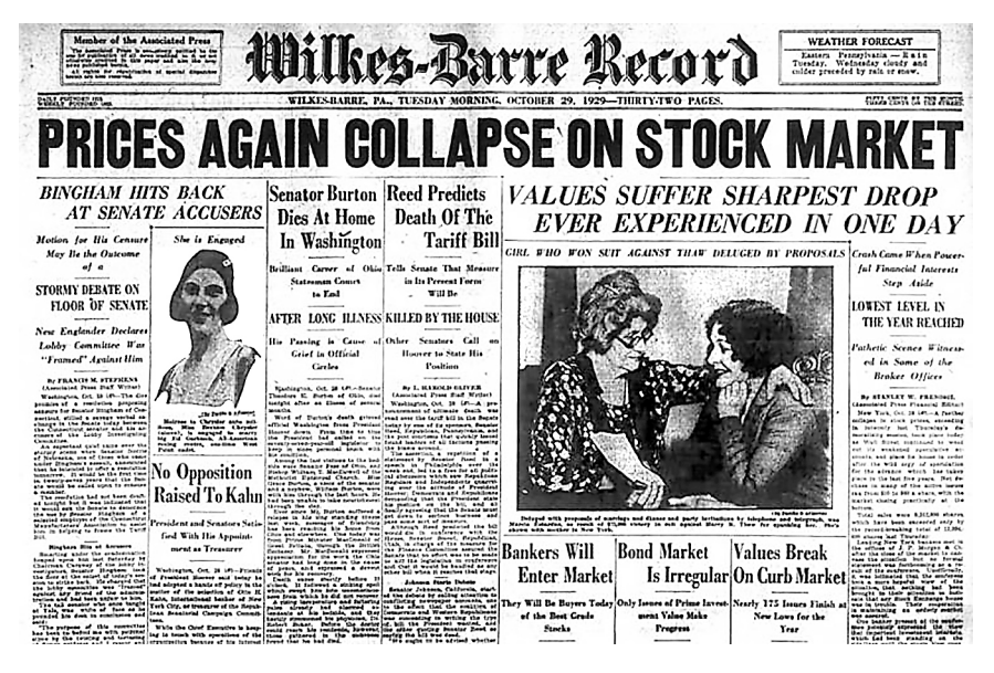
Figure 1. Frontpage of Wilkes-Barre Record , a local newspaper published in Bohm's hometown, reporting on the stock market collapse at the dawn of the infamous Black Tuesday on 29 October 1929. The Great Depression, together with the permeating social and cultural fragmentation of his local society at the time, had a great impact on the young Bohm.

depression made me begin to question those and saying that the society must have some responsibility".<sup>127</sup>