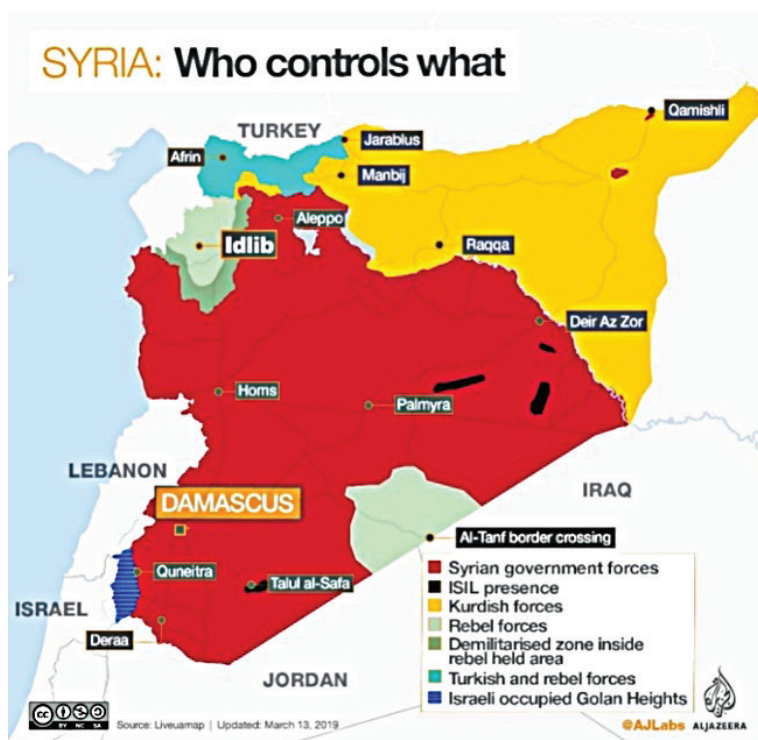
Figure 2: Territorial division in Syria

The area is strategically important, not only for the Syrian government but also for the Russian government, due to its proximity to a Syrian airbase owned by Russia.