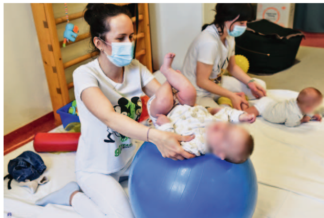
FIGURE 9. Children's (re)habilitation – kinesiotherapy SLIKA 9. Dječja (re)habilitacija – kinezioterapija

peut, logoped, defektolog – rehabilitator, psiholog, medicinska sestra te bolesnik, odnosno roditelj), ali i izvan nje. Pritom je važno naglasiti da je bolesnik aktivan član tima koji s napredovanjem liječenja i rehabilitacije postaje sve odgovorniji za ishode. Specifičnost za djecu s neurorazvojnim i sličnim poremećajima jest da multidisciplinarni tim pruža potporu i usmjerava roditelje o postupanjima, pravima i mogućnostima njihova participiranja. Krajnji cilj naših djelovanja jest ponov-