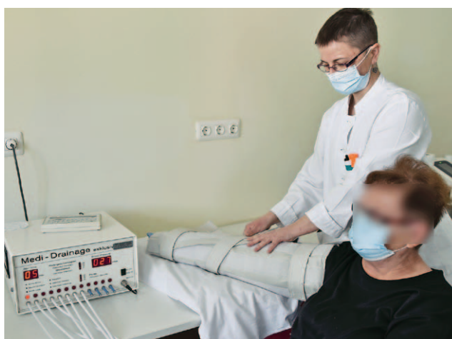
FIGURE 14. Physical therapy – lymphatic drainage of the hand SLIKA 14. Fizikalna terapija – limfna drenaža ruke