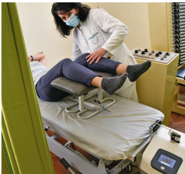
FIGURE 12. Physical therapy – traction of the lumbar spine SLIKA 12. Fizikalna terapija – trakcija slabinske kralježnice