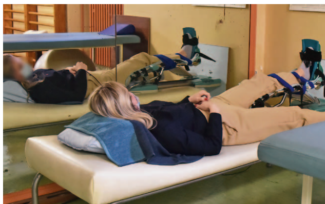
FIGURE 13. Physical Therapy – kinetek SLIKA 13. Fizikalna terapija – kinetek