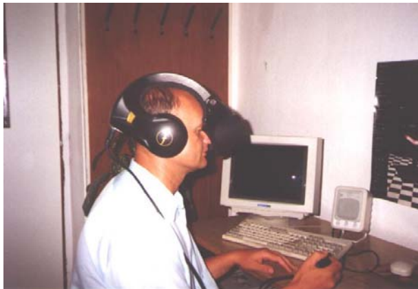
Figure 5. Experimental use of virtual reality in laboratory

The most advanced current form of Computer Aided Manufacturing is Virtual Manufacturing (VM) based on Virtual Reality (VR). VR representation techniques are widely used, which means that they have developed rapidly. In product manufacturing techniques and organization, virtual reality has become the basis for virtual manufacturing aimed at meeting the expectations of the users/buyers of products, and also with regard to their low cost and lead time. Virtual manufacturing includes the fast improvement of manufacturing processes without drawing on the machines' operating time fund. It is said that Virtual Manufacturing is the use of a desktop virtual reality system for computer-aided design of components and processes for manufacture [14]. An example of an application of a virtual reality system is in the laboratory of the Faculty of Manufacturing Technologies in Prešov (Slovakia) is seen in Fig. 5.