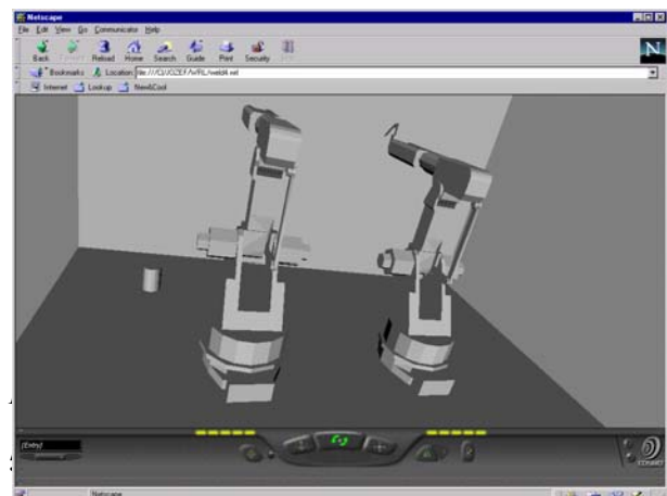
Figure 4. Automated workplace in the VRML environment

The activity of making VRML 2.0 is similar to VRML 1.0. It is initialised from the menu by activating the MAKE VRML2 item (with cursor on this item and than press ENTER, or with a right click of the mouse, or by pressing the hot key “2”). After this procedure follows a set of file names without the extension WRL, which will be added automatically. After file creation, the export of data starts. First, the header and preparatory knots (WorldInfo and Background) are exported. After this, all data are exported depending on the displaying regime—export of lines (Shape - for lines) or surfaces (Shape - for surfaces). The process of writing points is not arranged in a visible shapes regime. This is made in the case where some points are written twice and then are marked with name “pts”. When points and surfaces are defined, they are extended by the appropriate filename extension (“pts”), which are defined in lines. After the conclusion of the export, the exported file is closed and it is then possible to work the ROANS system as before. In the Figure 4 we can see a display of the automated workplace in the VRML environment.