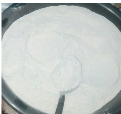
Figure 2. Freshly produced cocoyam flour