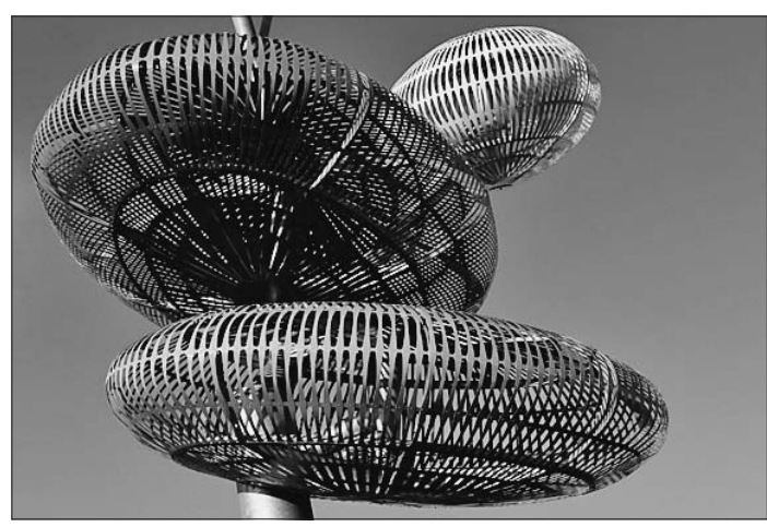
FIG. 7 EXAMPLE OF PUBLIC ART MADE WITH PERCENT FOR ART IN TEMPLE BAR (BY FERGAL MCCARTHY)

FIG. 8 EXAMPLE OF PUBLIC ART MADE WITH THE PERCENT FOR ART SCHEME (BY ANDREAS KOPP)