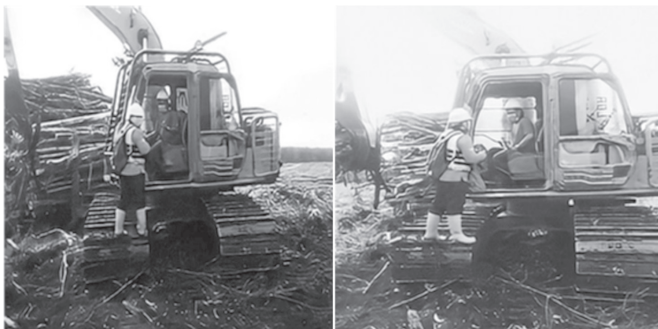
Fig. 3 Excavator Hitachi ZX110MF

per hour with price of IDR 10,000 liter -1 , oil consumption is 0.1 liter hour -1 , and wage of operator + assistant is IDR 400,000 day -1 . From these data, the cost of equipment use per hour was obtained and it is presented in Table 5.