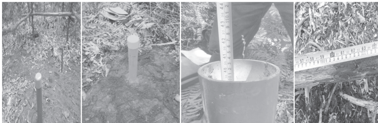
Fig. 2 Measurements of subsidence

observation points purposively, and the measurements were conducted each month. Measurements of subsidence are presented in Fig. 1 and 2.