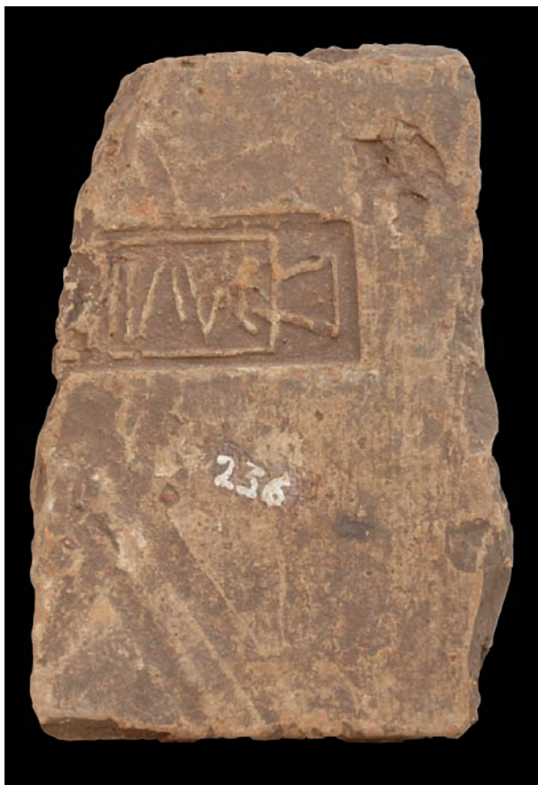
Slika 15. Crijev s pečatom Legio VIII Augusta, Arheološka zbirka FSH-a, TIP 1978, 236.

Literatura: Bojanovski 1990: 702, br. 1d, T. 2: 2; Škegro 1997: 106, br.151.