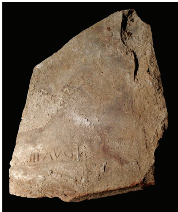
Slika 12. Crijep s pečatom Legio VIII Augusta, Arheološka zbirka FSH-a, bez inv. broja (snimio: R. Dodig, 2006).

References: Bojanovski 1985: 81, no. 4, pl. I: 4; 1990: 702, no. 1b; Škegro 1997: 106, no. 148.