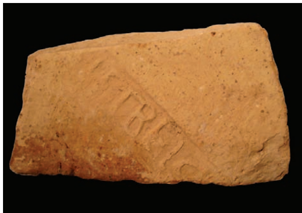
Slika 1. Crijep s pečatom Cohors I Belgarum, Arheološka zbirka FSH-a, bez inv. broja.

Literatura: AE 2000: 1180f; Atanacković-Salčić 1977: 84; Bojanovski 1985: 81, br. 5, T. I: 5; Škegro 1997: 107, br. 153.; HD 039844.