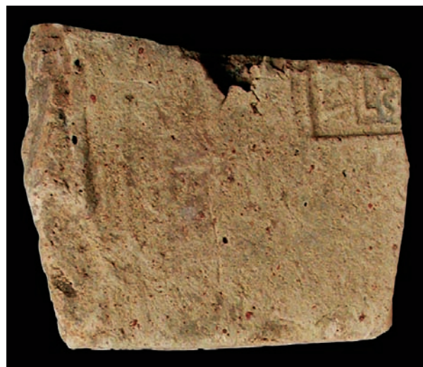
Slika 16. Crijev s pečatom Legio VIII Augusta, Arheološka zbirka FSH-a, inv. br. 132.

Figure 16. Tile bearing stamp Legio VIII Augusta, FSH Archaeological Collection, inv. no. 132.