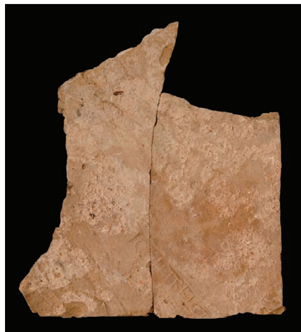
Slika 8. Crijepe s pečatom Cohors I Belgarum, Arheološka zbirka FSH-a, bez inv. broja.

Tile fragment, dimensions 27 × 26 × 3 cm in two pieces (Munsell 10YR, 7/4, very pale brown ), lightly fired, with grains of brick and traces of plaster. Stamp has dimensions of 12 × 2.5 cm, 1.8 cm long letters in relief, impressed in indented rectangular cartouche.