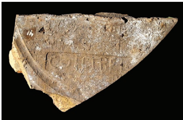
Slika 2. Crijepe s pečatom Cohors I Belgarum, Arheološka zbirka FSH-a, TIP 1977, br. 41.

Literatura: Bojanovski 1978: 13, sl. 11: 2; Škegro 1991: 224, T. I: 3.