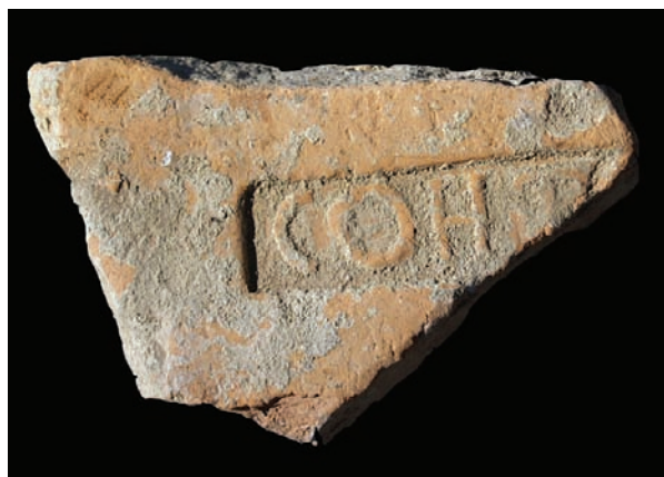
Slika 10. Crijep s pečatom Cohors I Belgarum, Arheološka zbirka FSH-a, TIP 1977, br. 156.

Figure 10. Tile bearing stamp Cohors I Belgarum, FSH Archaeological Collection, TIP 1977, no. 156.