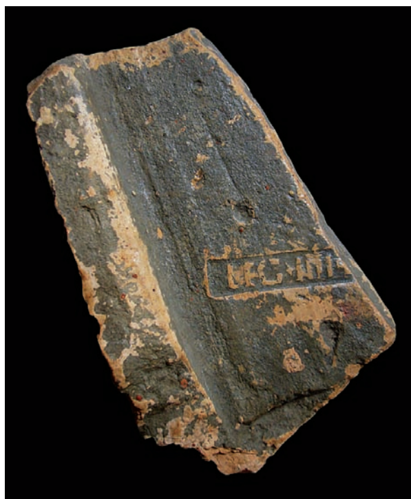
Slika 18. Crijep s pečatom Legio IIII Flavia felix, ZMS, inv. broj 1.

References: CIL III: 14021; AE 1894: 124; Patsch 1893: 679–681 (= Patsch 1895a: 526–527, fig. 33); Truhelka 1893: 675, fig. 4; Patsch 1899: 493 (= Patsch 1900: 81, fig. 55); Patsch 1914: 162, fig. 21; Pašalić 1960: 57 (2); Alföldy 1967: 47 (= Alföldy 1987: 320);