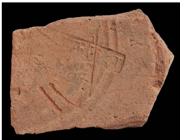
Slika 9. Crijep s pečatom Cohors I Belgarum, Arheološka zbirka FSH-a, bez inv. broja (snimio: R. Dodig, 2006).

Figure 9. Tile bearing stamp Cohors I Belgarum, FSH Archaeological Collection, no inv. no. (photograph: R. Dodig, 2006).