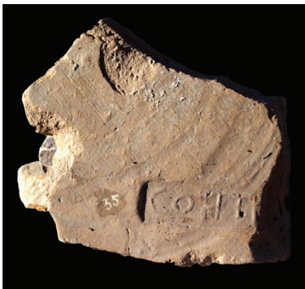
Slika 3. Crijepe s pečatom Cohors I Belgarum, Arheološka zbirka FSH-a, TIP 1977, br. 35.

Ulomak crijepe dimenzija 15 × 13 × 3,5 cm (Munsell 5YR 7/5, reddish yellow), meko pečen, bez vidljivih primjesa. Očuvani dio pečata ima dimenzije 6,5 × 2,2 cm, reljefna slova duljine 1,5 cm u udubljenoj