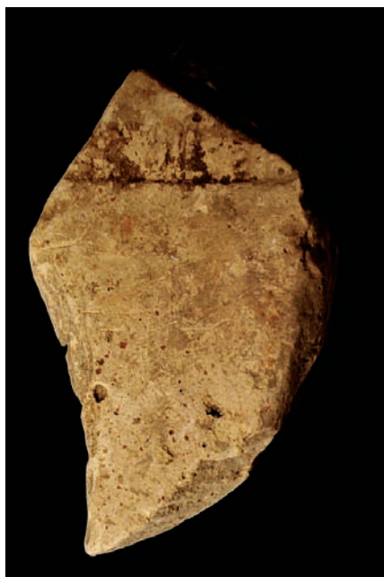
Slika 19. Crijep s pečatom Legio III Flavia felix, Arheološka zbirka FSH-a, inv. broj 133.

Literatura: AE 2000: 1180a; Bojanovski 1985: 78–81, br. 3, T. I: 3; Škegro 1997: 147; HD 039826.