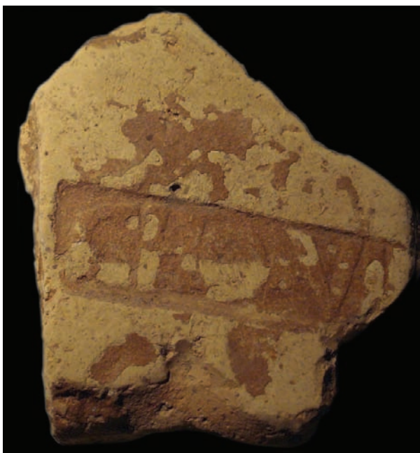
Slika 21. Crijep s pečatom Cohors VIII voluntariorum civium Romanorum, Arheološka zbirka FSH-a, bez inv. broja.

Literatura: AE 2000: 1180g; Atanacković-Salčić 1977: 81; Bojanovski 1985: 81, br. 6, T. I: 6; Škegro 1997: 107, br. 154; HD 039845.