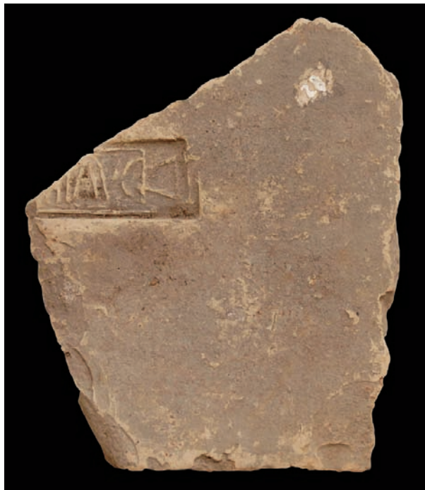
Slika 13. Crijep s pečatom Legio VIII Augusta, Arheološka zbirka FSH-a, TIP 1977, br. 28.

Literatura: Bojanovski 1990: 702, br. 1c, T. 2: 1; Škegro 1997: 106, br. 150.