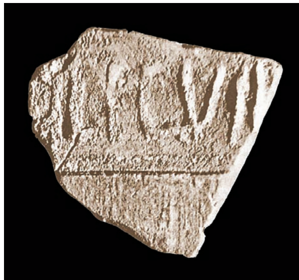
Slika 14. Crijep s pečatom Legio VIII Augusta, TIP 1978, br. 90, izgubljen (Bojanovski 1990: 711).

References: Bojanovski 1990: 702, no. 1e, pl. 1; Škegro 1997: 106, no. 152.