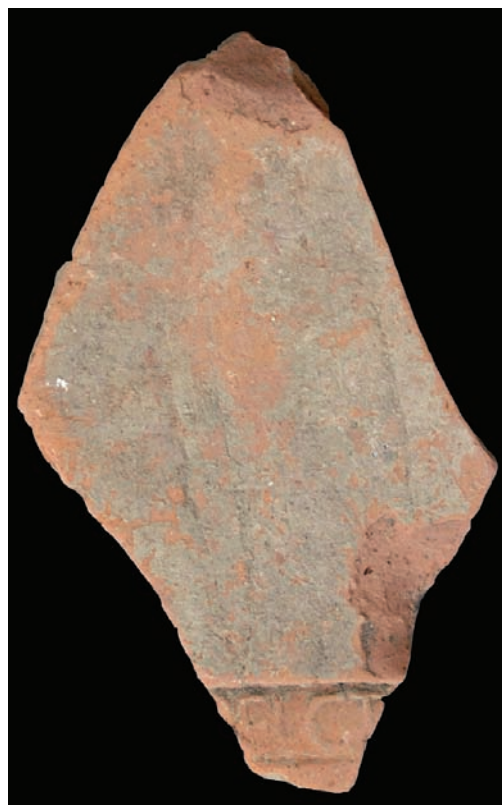
Slika 6. Crijep s pečatom Cohors I Belgarum, Arheološka zbirka FSH-a, TIP 1978, br. 248.

Tile fragment, dimensions 22.5 × 14.5 × 3.2 cm (Munsell 5YR 7/5, reddish yellow), good facture