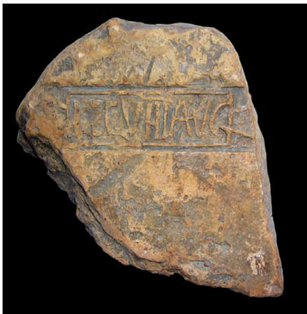
Slika 11. Crijep s pečatom Legio VIII Augusta, ZMS, inv. broj 4 (snimila: A. Pravidur, 2007).

Literatura: CIL III: 6435 = 10181 1 = 13339 2 ; Patsch 1895: 43 (= Patsch 1897: 338–340); Patsch 1899: 508–510, sl. 25 (= Patsch 1900: 96, sl. 69); Patsch 1914: 162, sl. 22; Alföldy 1967: 46 (= Alföldy 1987: 319); Bojanovski 1990: 702, br. 1a; Škegro 1991: 223, T. I: 1.