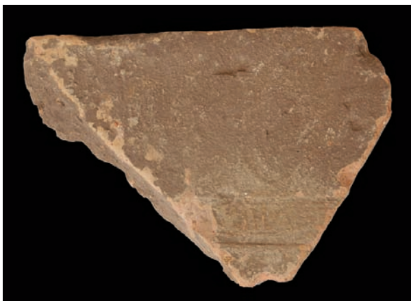
Slika 17. Crijep s pečatom Legio VIII Augusta, Arheološka zbirka FSH-a, bez inv. broja.

Figure 17. Tile bearing stamp Legio VIII Augusta, FSH Archaeological Collection, no inv. no..