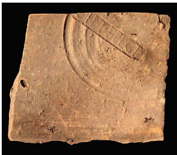
Slika 5. Crijep s pečatom Cohors I Belgarum, Arheološka zbirka FSH-a, TIP 1978, br. 237.

Figure 5. Tile bearing stamp Cohors I Belgarum, FSH Archaeological Collection, TIP 1978, no. 237.