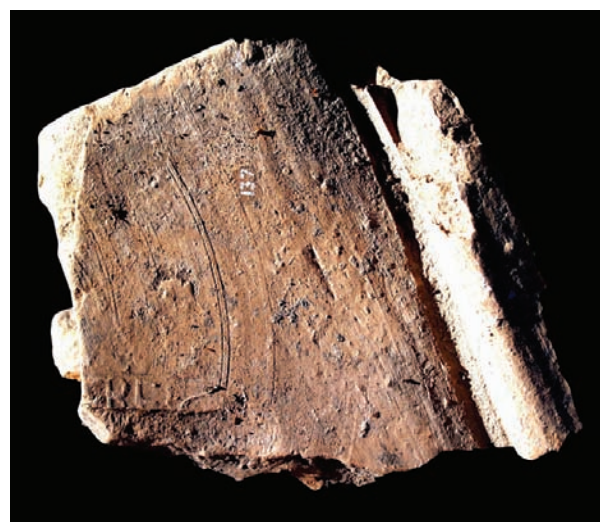
Slika 4. Crijepe s pečatom Cohors I Belgarum, Arheološka zbirka FSH-a, TIP 1977, br. 137 (snimio: R. Dodig, 2006).

Tile fragment, dimensions 22 × 21.5 × 2.5 cm (Munsell 5YR 7/6, reddish yellow), lightly fired, with traces of plaster. Partially preserved stamp has dimensions of 5.5 × 1.2 cm, 1 cm letters in relief in an impressed