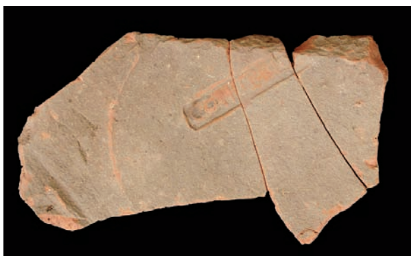
Slika 7. Crijepe s pečatom Cohors I Belgarum, Arheološka zbirka FSH-a, TIP 1980, br. 84 (snimio: Studio Omega, Ljubuški, 2007).

Figure 7. Tile bearing stamp Cohors I Belgarum, FSH Archaeological Collection, TIP 1980, no. 84 (photograph: Studio Omega, Ljubuški, 2007).